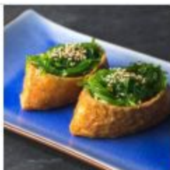
Vegetarian Spring Roll Each.