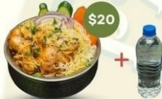
CHICKEN BIRYANI FULL