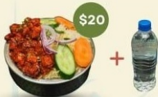
CHICKEN 65 BIRYANI FULL