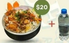
VEGETABLE BIRYANI FULL