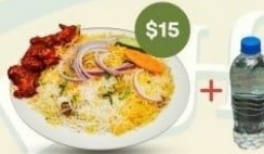
CHICKEN 65 BIRYANI PLATE