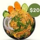
VEG / EGG / CHICKEN NOODLES

NOTE : WATER BOTTLE IS COMPLIMENTARY ONLY FOR DINE IN