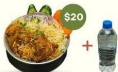
MUTTON BIRYANI FULL