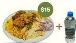
MUTTON BIRYANI PLATE