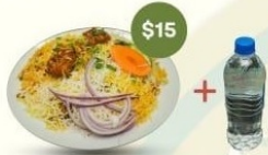
CHICKEN BIRYANI PLATE