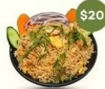
VEG / EGG / CHICKEN FRIED RICE