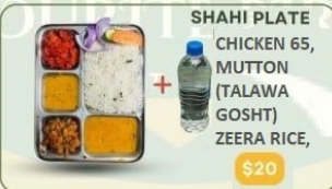
SHAHI PLATE CHICKEN 65, MUTTON (TALAWA GOSHT) ZEERA RICE,