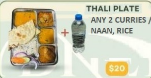
THALI PLATE ANY 2 CURRIES / NAAN, RICE