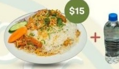
VEGETABLE BIRYANI PLATE