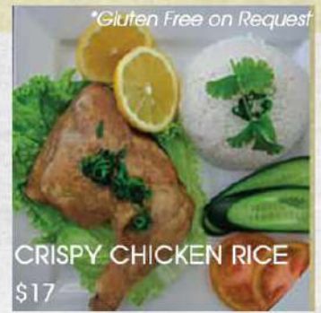
CRISPY CHICKEN RICE $17 *Gluten Free on Request