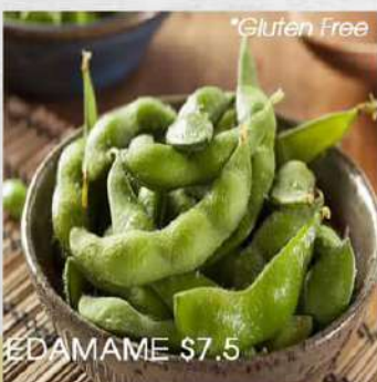
*Gluten Free EDAMAME $7.5