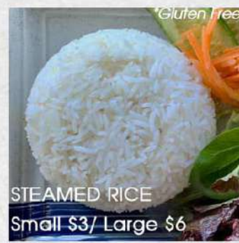
STEAMED RICE Small $3/ Large $6 *Gluten Free