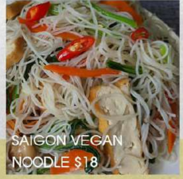
SAIGON VEGAN NOODLE $18