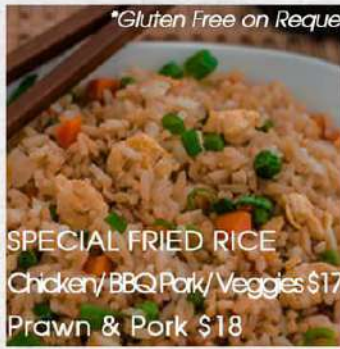
SPECIAL FRIED RICE Chicken/BBQ Pork/Veggies $17 Prawn & Pork $18 *Gluten Free on Request