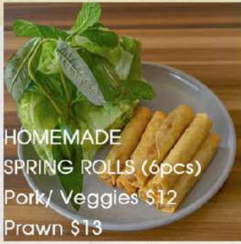
HOMEMADE SPRING ROLLS (6pcs) Pork/ Veggies $12 Prawn $13