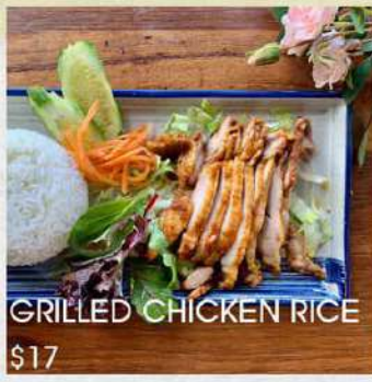
GRILLED CHICKEN RICE $17