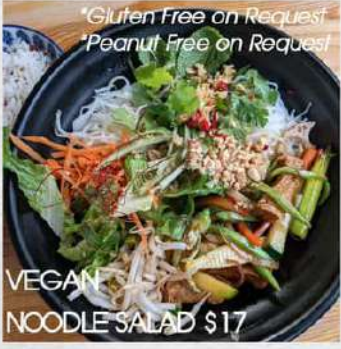
VEGAN NOODLE SALAD $17 *Gluten Free on Request *Peanut Free on Request