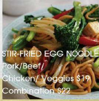
STIR-FRIED EGG NOODLE Pork/Beef/ Chicken/ Veggies $19 Combination $22