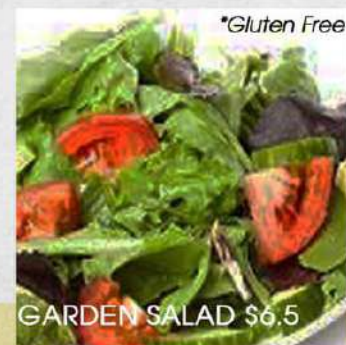
*Gluten Free GARDEN SALAD $6.5