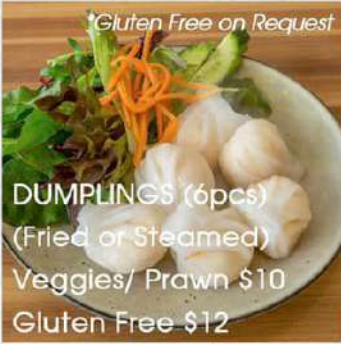
*Gluten Free on Request DUMPLINGS (6pcs) (Fried or Steamed) Veggies/ Prawn $10 Gluten Free $12