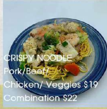
CRISPY NOODLE Pork/Beef/ Chicken/ Veggies $19 Combination $22