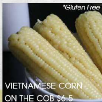
*Gluten Free VIETNAMESE CORN ON THE COB $6.5