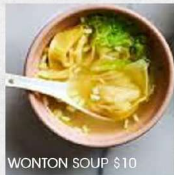
WONTON SOUP $10