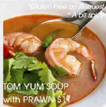
*Gluten Free on Request *A bit spicy TOM YUM SOUP with PRAWN $11