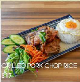
GRILLED PORK CHOP RICE $17