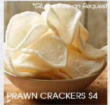
*Gluten Free on Request PRAWN CRACKERS $4