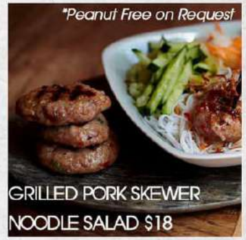
GRILLED PORK SKEWER NOODLE SALAD $18 *Peanut Free on Request