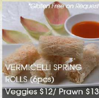
*Gluten Free on Request VERMICELLI SPRING ROLLS (6pcs) Veggies $12/ Prawn $13