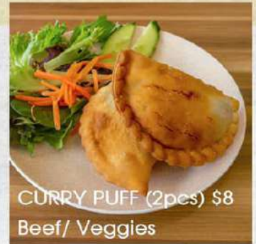
CURRY PUFF (2pcs) $8 Beef/ Veggies