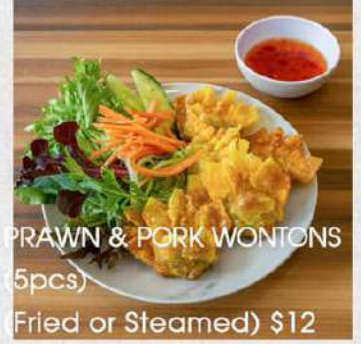
PRAWN & PORK WONTONS (5pcs) (Fried or Steamed) $12