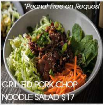
GRILLED PORK CHOP NOODLE SALAD $17 *Peanut Free on Request