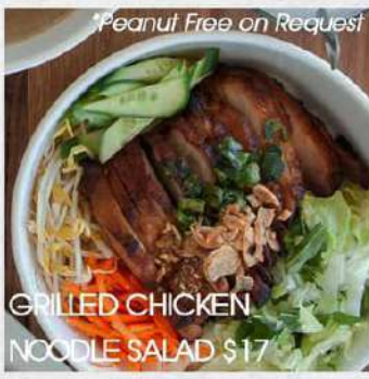
GRILLED CHICKEN NOODLE SALAD $17 *Peanut Free on Request