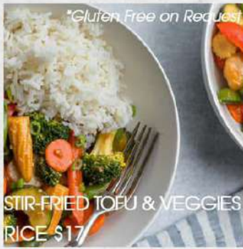
STIR-FRIED TOFU & VEGGIES RICE $17 *Gluten Free on Request