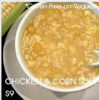
*Gluten Free on Request CHICKEN & CORN SOUP $9