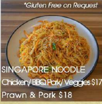
SINGAPORE NOODLE Chicken/BBQ Pork/Veggies $17 Prawn & Pork $18 *Gluten Free on Request