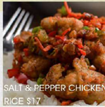
SALT & PEPPER CHICKEN RICE $17