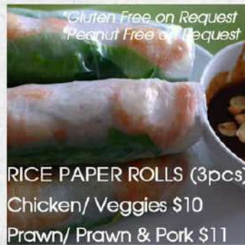
*Gluten Free on Request *Peanut Free on Request RICE PAPER ROLLS (3pcs) Chicken/ Veggies $10 Prawn/ Prawn & Pork $11