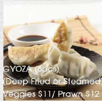
GYOZA (6pcs) (Deep Fried or Steamed) Veggies $11/ Prawn $12