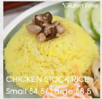
CHICKEN STOCK RICE Small $4.5/ Large $8.5 *Gluten Free