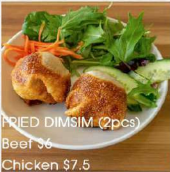
FRIED DIMSIM (2pcs) Beef $6 Chicken $7.5