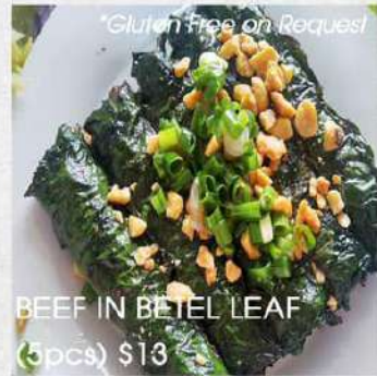
*Gluten Free on Request BEEF IN BETEL LEAF (3pcs) $13