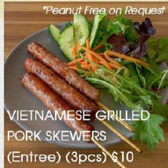
*Peanut Free on Request VIETNAMESE GRILLED PORK SKEWERS (Entree) (3pcs) $10