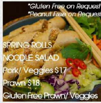
SPRING ROLLS NOODLE SALAD Pork/ Veggies $17 Prawn $18 Gluten Free Prawn/ Veggies *Gluten Free on Request *Peanut Free on Request