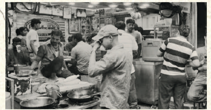
In Picture. The Parathe wali gali literally meaning the lane of parathas is an iconic places for foodies nested in the heart of Chandni Chowk in Delhi.

Parathas are unleavened, Indian flatbreads cooked on a griddle and celebrated for their flaky texture.