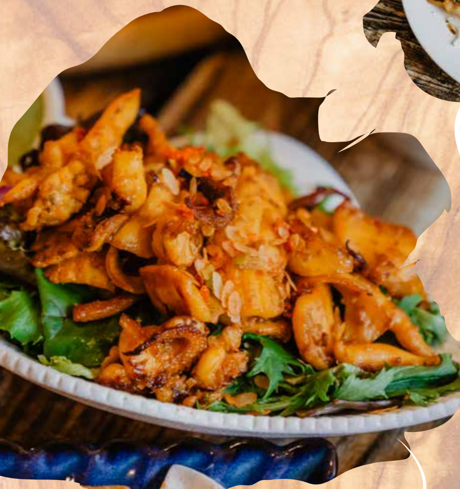
Rau Mực Rang Muối Salt and Pepper Squid Tentacles