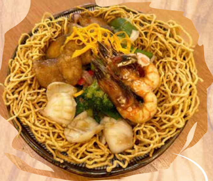
Mi Xào Giòn Đồ Biển / Bò / Gà Crispy Fried Noodle