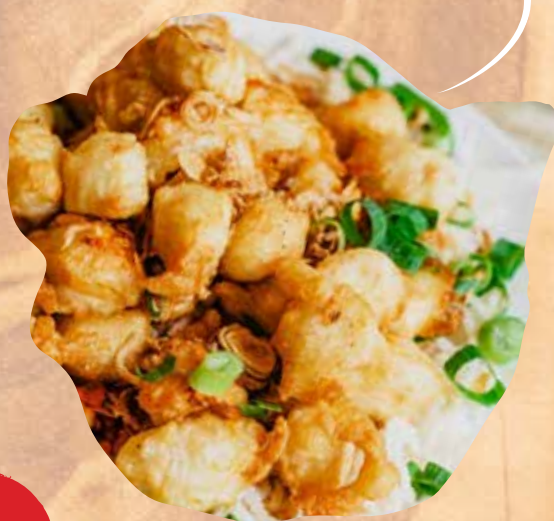
Mực Chiên Bơ Tỏi Fried Squids with Butter and Garlic