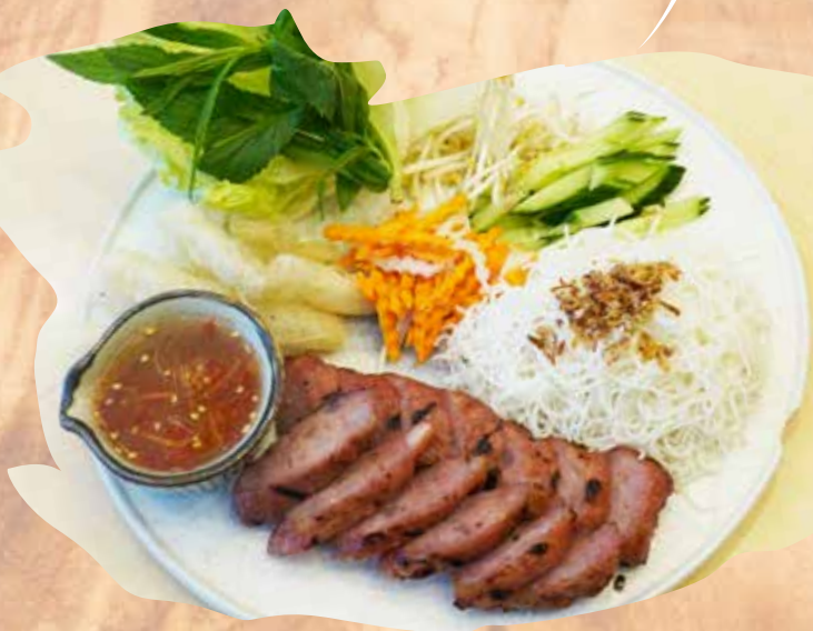
Bún Nem Nướng Rice Vermicelli with Grilled Pork Sausage