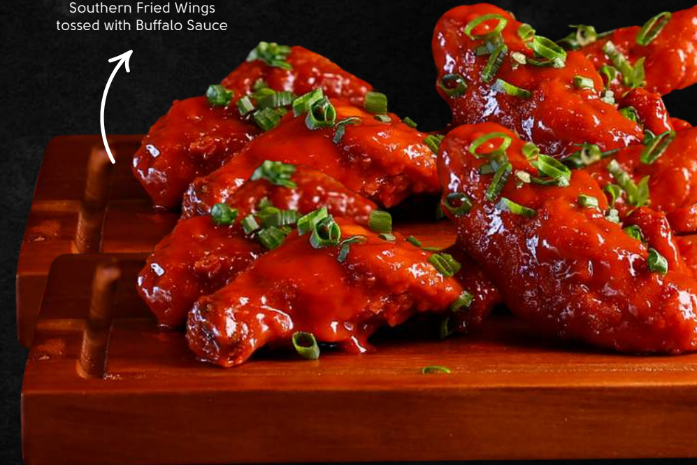
Southern Fried Wings tossed with Buffalo Sauce