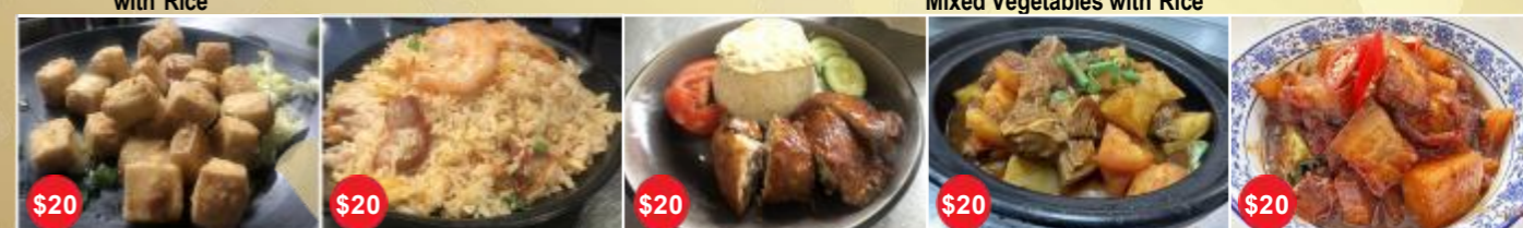
$20 椒盐豆腐+饭 Salt and Pepper Tofu with Rice $20 扬州炒饭 Yangzhou Fried Rice $20 炸鸡腿+饭 Fried Chicken Drumstick with Rice $20 红烧牛腩+饭 Braised Beef Brisket with Rice $20 红烧肉+饭 Braised Pork Belly with Rice