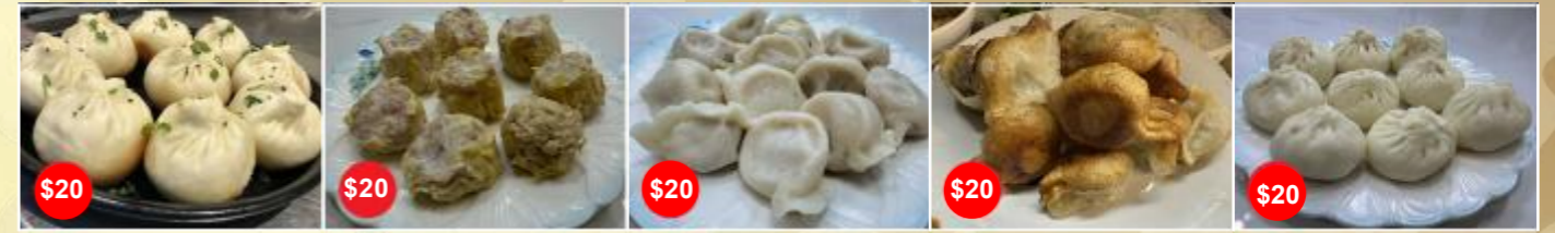
$20 生煎包 Pan-Fried Buns $20 烧卖 Steamed Dumplings $20 白菜水饺 Cabbage Dumplings $20 猪肉白菜 Pork and Cabbage Dumplings $20 北方小包子 Northern Style Buns