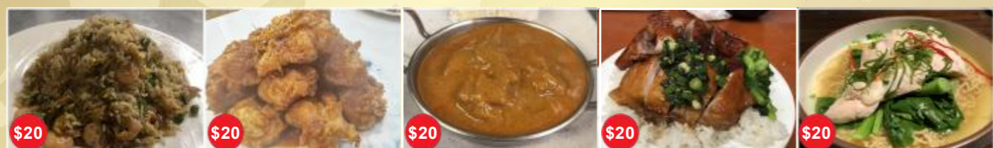
$20 扬州炒饭 Yangzhou Fried Rice $20 炸鸡块 Fried Chicken Pieces $20 咖喱牛肉饭 Curry Beef Rice $20 烧鸭饭 Roast Duck with Rice $20 鸡肉汤面 Chicken Noodle Soup