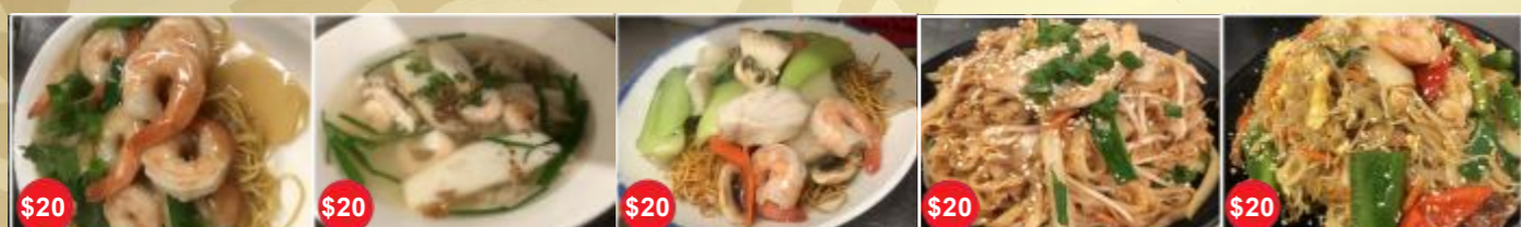
$20 虾盖面 Shrimp Gravy Noodles $20 海鲜汤河 Seafood Rice Noodle Soup $20 杂会盖面 Mixed Meat Gravy Noodle $20 泰国炒河粉 Pad Thai $20 新洲炒米粉 Singapore Fried Rice