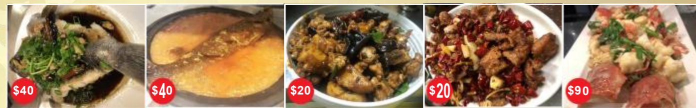
$40 青蒸草+饭 Steamed Grass Carp with Rice $40 新洲鱼+饭 Xinzhou.Style Fish with Rice $20 啤酒鸭+饭 Beer.Braised Duck with Rice $20 辣子肥肠+饭 Spicy Pork Intestines with Rice $90 姜葱龙虾 Ginger & Scallion Lobster