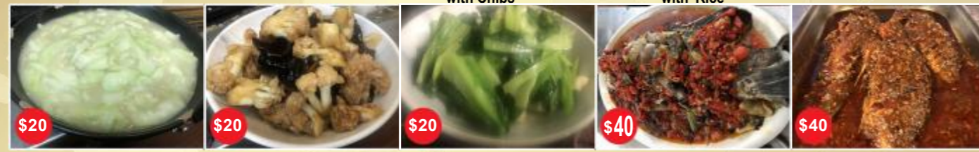
$20 鸡肉丝瓜 Chicken with Loofah $20 青炒花菜+饭 Stir.Fried Cauliflower with Rice $20 蒜炒油麦菜+饭 Garlic Stir.Fried Romaine Lettuce with Rice $40 剁椒鱼+饭 Chopped Chili Fish with Rice $40 干烧鱼一条+饭 Whole Braised Fish with Rice