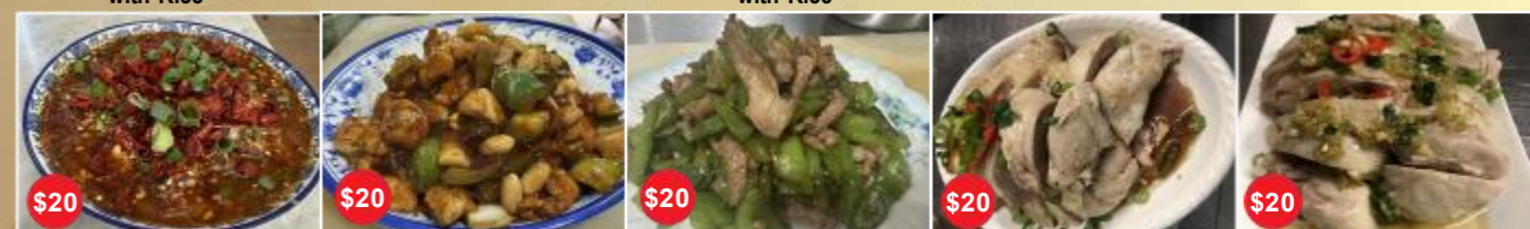
$20 水煮牛肉+饭 Sichuan Boiled Beef with Rice $20 宫保鸡丁+饭 Kung Pao Chicken with Rice $20 青椒炒肉丝+饭 Stir Fried Shredded Pork with Rice $20 腾椒鸡+饭 Green Peppercorn Chicken with Rice $20 白切鸡+饭 Cantonese style Chicken with Rice