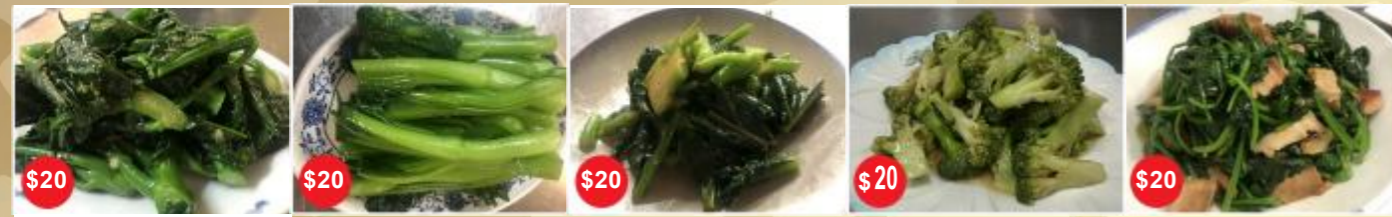
$20 蒜蓉芥菜+饭 Garlic Mustard Greens with Rice $20 耗油菜心+饭 Oyster Sauce Choy with Rice $20 耙油芥菜+饭 Braised Mustard Greens with Rice $20 蒜蓉西兰花+饭 Garlic Broccoli with Rice $20 蒜蓉炒空心菜+饭 Garlic Stir.Fried Water Spinach with Rice