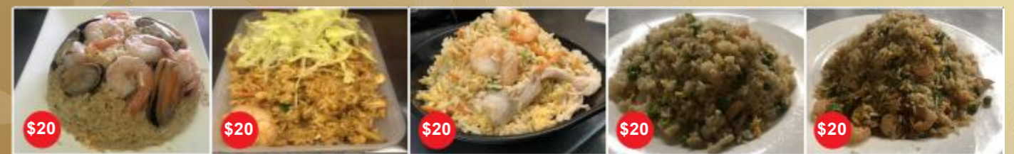
$20 杂会海鲜炒饭 Mixed Seafood Fried Rice $20 咖喱虾炒饭 Fried Rice with Curry Shrimp $20 杂会炒饭 Special Fried Rice $20 鸭肉炒饭 Fried Rice with Duck $20 印尼炒饭 Indonesian Fried Rice