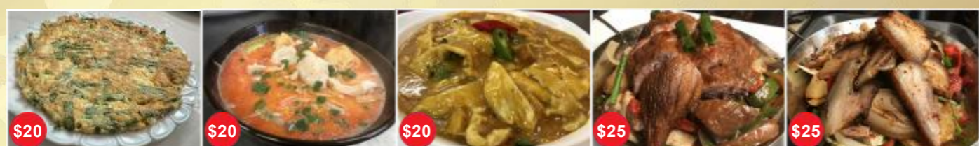
$20 鸡蛋饼 Egg Pancake $20 鸡肉叻沙 Chicken Laksa $20 咖喱粉+饭 Curry Powder Rice $25 干锅鸭 Duck Wok $25 干锅猪肉+饭 Pork Wok with Rice