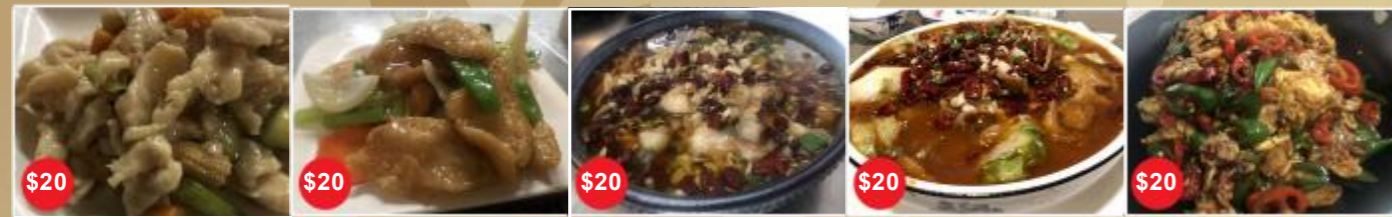
$20 菠萝鸡+饭 Pineapple Chicken with Rice $20 炒鱼片+饭 Stir.fried Fish Fillet with Rice $20 水煮鱼片+饭 Sichuan Boiled Fish with Rice $20 酸菜鱼+饭 Pickled Fish Fillet & Rice $20 农家一碗香+饭 Farmer's Stir.Fry with Rice