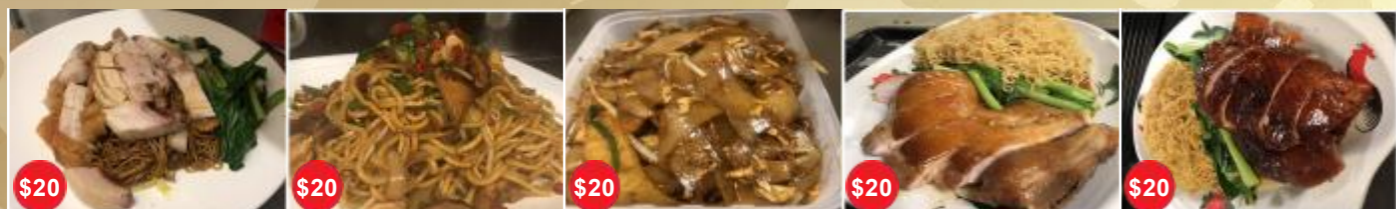
$20 烧肉干捞面 Roast Pork Dry Noodles $20 马来炒面 Malaysian Style Fried Noodles $20 干炒牛河 Stir Fried Beef Ho Fun (Dry) $20 油鸡面 Soy Sauce Chicken Noodles $20 烧鸭面 Roast Duck Noodles