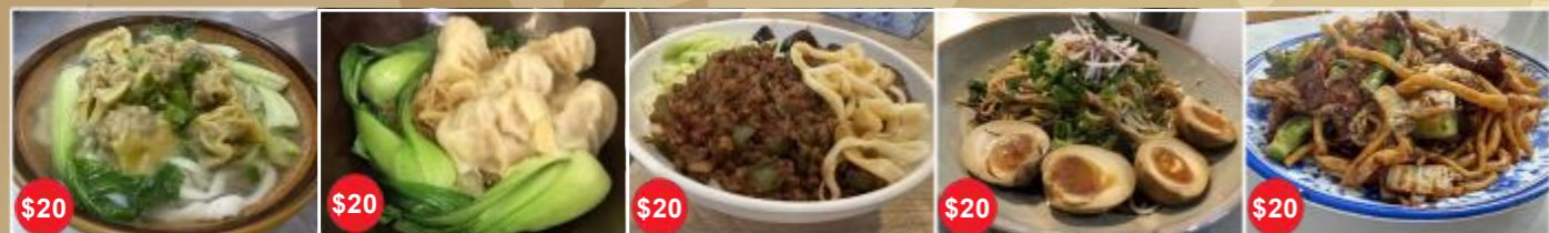
$20 云吞汤米线 Wonton Soup Rice Noodle $20 云吞干捞面 Dry Tossed Wonton Noodles $20 麻辣肉酱拌面 Spicy Minced Meat Noodles $20 麻辣拌面 Spicy Mixed Noodles $20 牛肉炒面 Beef Fried Noodles