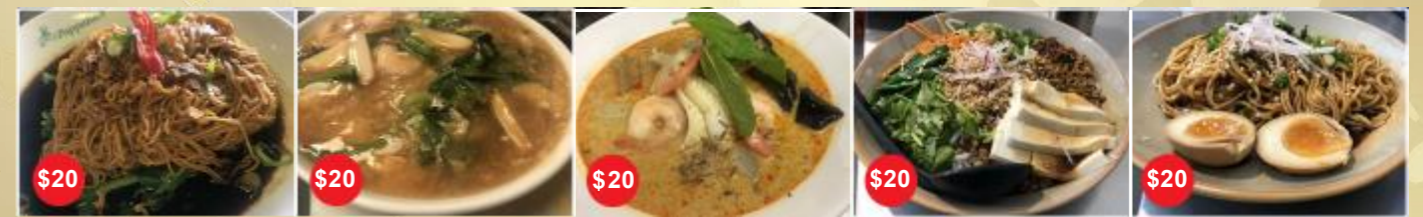
$20 牛腩干捞面杂会 Beef Brisket Noodle $20 滑旦河粉 Rice Noodle with Egg $20 海鲜叻沙 Seafood Laksa $20 肉碎麻辣汤米线 Spicy Rice Noodles with Minced Meat $20 肉碎拌面 Noodles with Minced Meat