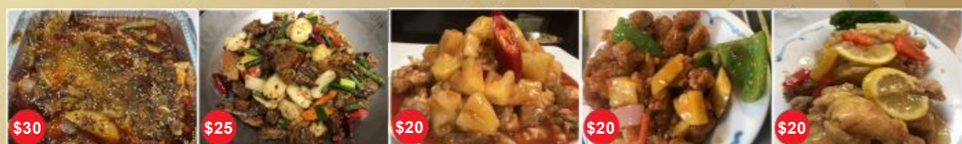
$30 麻辣烤鱼+饭 Spicy Fish with Rice $25 干锅羊肉+饭 Lamb Wok with Rice $20 古老肉+饭 Sweet and Sour Pork with Rice $20 古老鸡+饭 Sweet and Sour Chicken with Rice $20 柠檬鸡+饭 Lemon Chicken with Rice