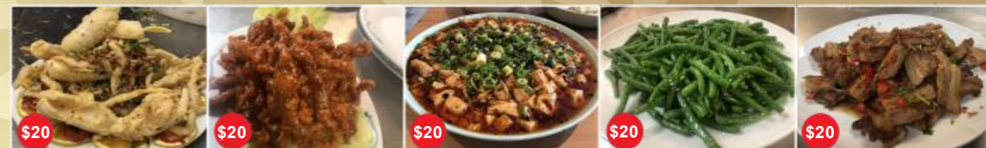
$20 椒盐鱿鱼+饭 Salt & Pepper Squid with Rice $20 北京牛肉丝+饭 Beijing Style Shredded Beef with Rice $20 麻辣豆腐+饭 Spicy Tofu with Rice $20 干偏四季豆+饭 Dry Fried Green Beans with Rice $20 回锅肉+饭 Twice Cooked Pork with Rice