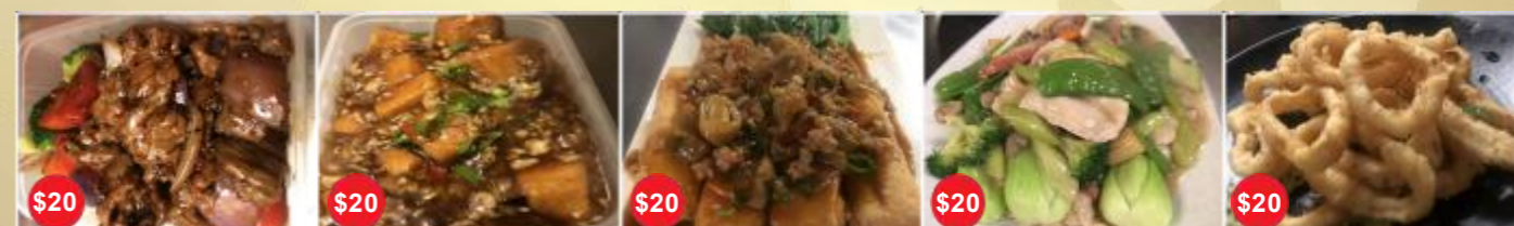
$20 豆豉牛肉+饭 Black Bean Sauce Beef with Rice $20 红烧豆腐+饭 Braised Tofu with Rice $20 肉碎豆腐+饭 Minced Meat Tofu with Rice $20 鸡肉炒杂菜+饭 Chicken Stir Fried Mixed Vegetables with Rice $20 椒盐鱿鱼+饭 Salt and Pepper Squid with Rice