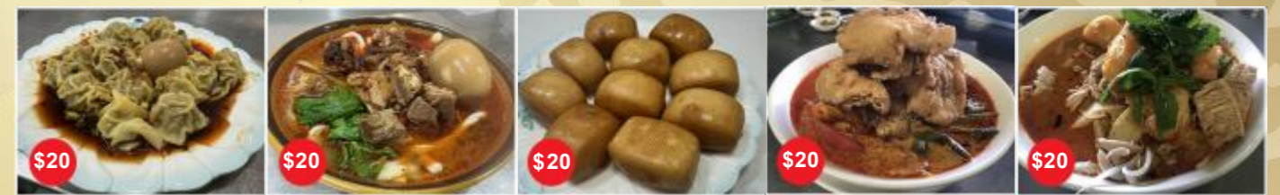
$20 红油抄手 Red Oil Worton $20 红烧牛肉面 Braised Beef Noodle $20 炸馒头 Fried Buns $20 咖喱鱼头汤米粉 Curry Fish Head Rice Noodle $20 牛肉叻沙 Beef Laksa