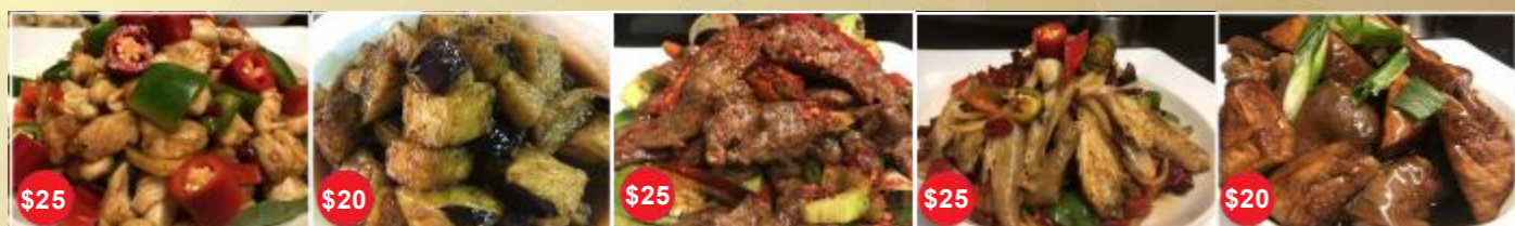
$25 干锅杂会+饭 Mixed Meat Wok with Rice $20 红烧茄子+饭 Braised Eggplant with Rice $25 干锅牛肉+饭 Beef Wok with Rice $25 干锅肥肠+饭 D Pork Intestines Wok with Rice $20 麻辣猪蹄+饭 Spicy Braised Pork Trotters with Rice