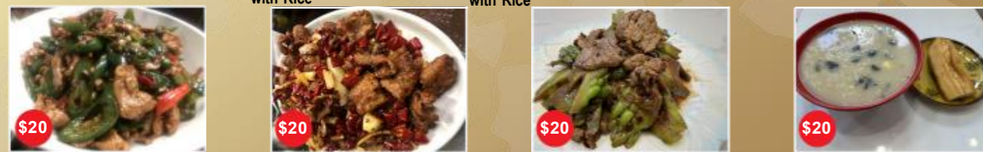
$20 尖椒炒猪肉+饭 Stir.Fried Pork with Chili Peppers & Rice $20 辣子鸡丁+饭 Spicy Diced Chicken with Rice $20 牛肉炒凉瓜 Stir.Fried Beef with Bitter Melon $20 皮蛋瘦肉粥 Century Egg & Lean Pork Porridge