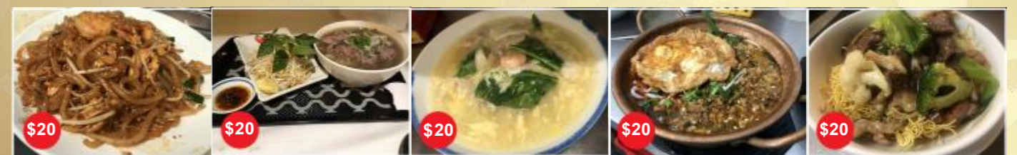
$20 X O海鲜炒米线 XO Seafood Fried Rice $20 生熟牛肉汤河 Rare & Well.Done Beef Pho $20 海鲜滑蛋河粉 Seafood Rice Noodle with Eggs $20 肉膜麻辣肥牛汤 Spicy Beef Brisket Soup $20 土豆粉杂会猪牛鸡盖面 Rice Noodles with Pork, Beef & Chicken