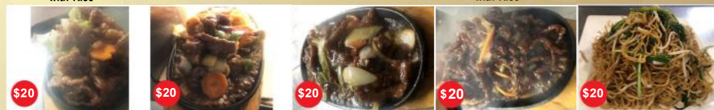
$20 铁板猪肉片 Sizzling Pork Slices $20 铁板蒙古牛+饭 Sizzling Mongolian Beef with Rice $20 铁板沙爹牛肉鸡肉+饭 Sizzling Satay Beef & Chicken with Rice $20 铁板牛肉丝+饭 Sizzling Shredded Beef with Rice $20 豉油王炒面 Soy Sauce King Fried Noodles