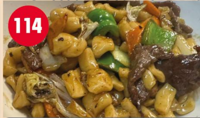
牛肉炒乌冬面 $20 Beer Fried STYLE Noodles