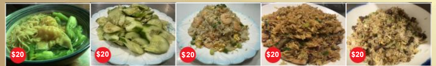
$20 云吞汤面 Wonton Noodle Soup $20 凉拌黄瓜 Cold Tossed Cucumber Salad $20 虾仁炒饭 Fried Rice with Shrimp $20 糯米饭 Fried Sticky Rice $20 牛肉炒饭 Fried Rice with Beef