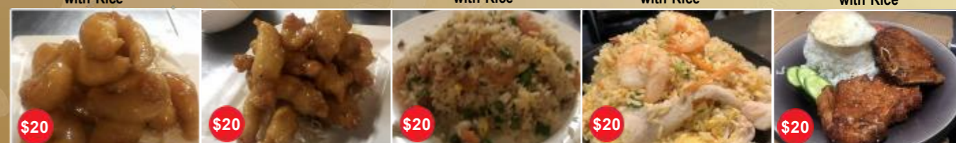
$20 密糖虾+饭 Honey Shrimp with Rice $20 密糖鸡+饭 Honey Chicken with Rice $20 菠萝鸡炒饭 Pineapple Chicken Fried Rice $20 盐鱼鸡炒饭 Salted Fish Chicken Fried Rice $20 猪扒饭 Pork Chop Rice