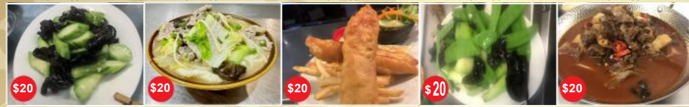
$20 青炒丝瓜+饭 Stir.Fried Loofah with Rice $20 羊肉汤面 Lamb Noodle Soup $20 炸鱼块薯条 Deep.Fried Fish Pieces with Chips $20 素炒杂菜+饭 Vegetarian Mixed Stir.Fry with Rice $20 麻辣牛腩+饭 Spicy Beef Brisket with Rice