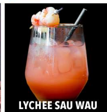
LYCHEE SAU WAU