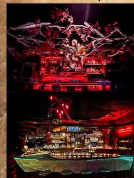
Bad Mama Keelung