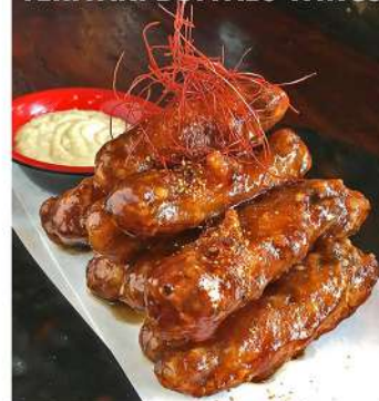
TERIYAKI BUFFALO WINGS