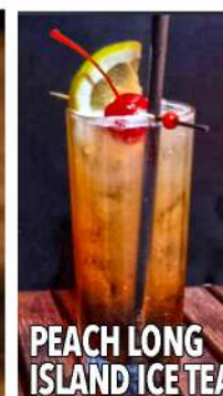
PEACH LONG ISLAND ICE TEA