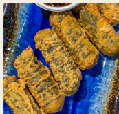
Fried Seaweed Roll 15 VG (6pcs)