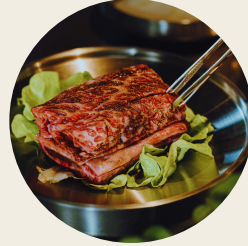
Marinated Black Angus Galbi 42/230g