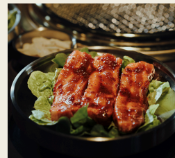
Spicy Pork Belly 30