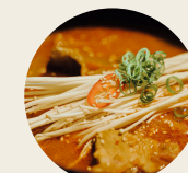
Kimchi Stew 20