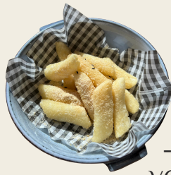
Tteokkochi 10 -Snow Cheese -Hot&Spicy -Honey Soy Garlic VG

Depending on supply availability, some ingredients may not be provided or may be substituted/modified.