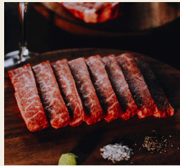
Wagyu Short Ribs MB6-7 52/200g GF