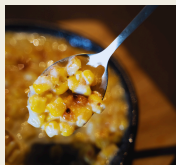
Cheesy Creamed Corn 5 VG/GF