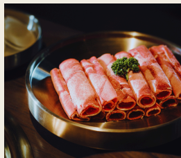
Sliced OX Tongue 34/200g GF