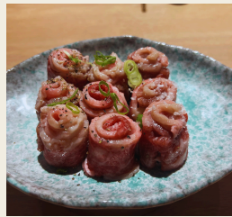
Wagyu Karubi 32/200g GF