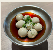
Marinated Quail Egg 5 VG (8pcs)