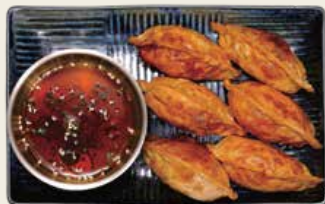
Mandoo (6 pieces) -Spicy Octopus 16 -Vegetables (VG) 14 -Buldak (VG) 14