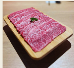
Black Angus Oyster Blade 32/200g GF