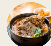
Spicy Pork Bone Soup 24