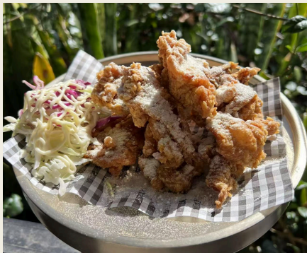
Original Half 22/ Full 40