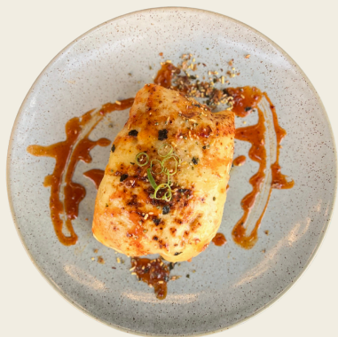
Buldak Ramen Omelette 18 VG