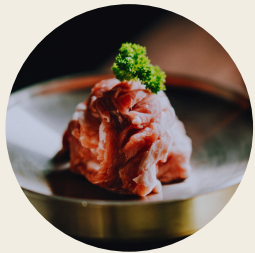
Pork Belly 28 GF