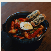
Teokbokki 17 (add cheese 3)