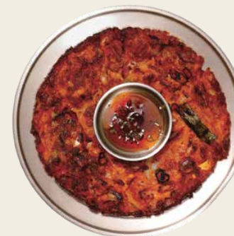
-Seafood Pancake 16