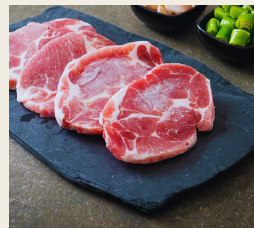
Pork Scotch 26 GF