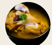
Ginseng Chicken Soup 32

*Please let us know of any allergies you have so we can accommodate you*