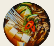
Soybean Stew 20 VG