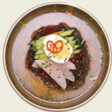
Mul-Naengmyeon Korean Cold Noodle 18 VG available