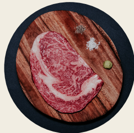
Wagyu Scotch Fillet MB9+ 62/200g GF