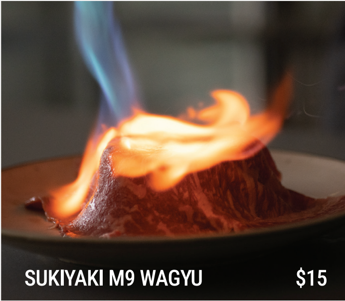
SUKIYAKI M9 WAGYU