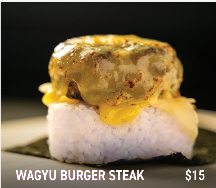
WAGYU BURGER STEAK