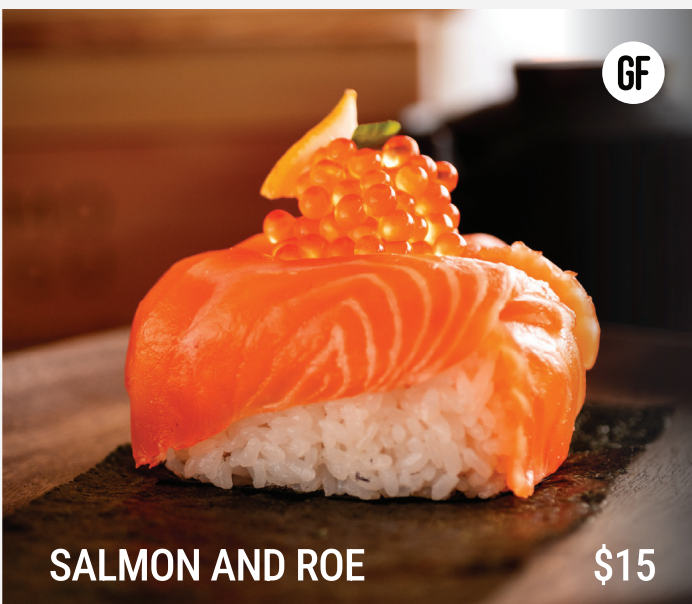
SALMON AND ROE