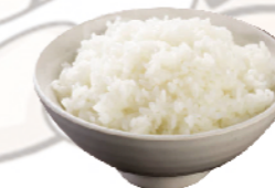
CHOOSE RICE OR DRY NOODLE