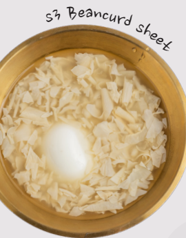
S3 Beancurd sheet

S7 Taro and coconut milk sweet soup ..... Hot or Cold $10.5 with sago and strawberry