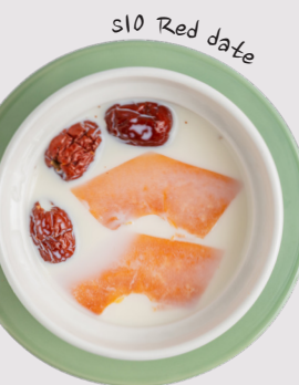
S10 Red date

Black sesame rice ball or Red bean rice ball