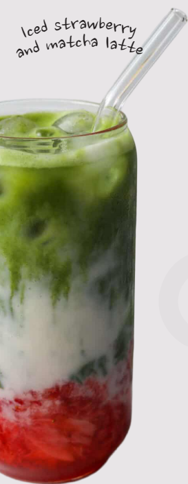
Iced strawberry and matcha latte