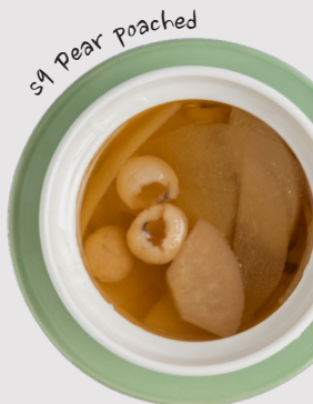
S9 Pear poached