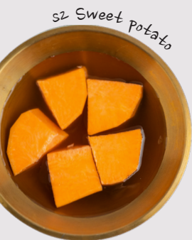
S2 Sweet potato

Smooth, fragrant, and just the right amount of sweet.