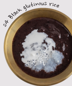
S4 Black glutinous rice