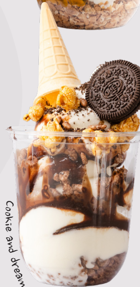
Cookie and dream