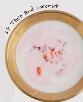
S7 Taro and coconut