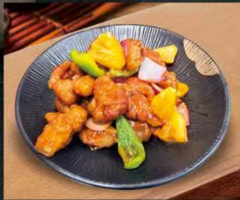
咕佬肉 $ 30.8 Sweet & Sour Pork