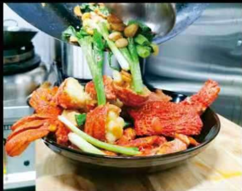
配生麵、伊麵、煎米粉底加$15 Add $15 for a side of fresh noodles, yi mein, or pan-fried rice noodle base