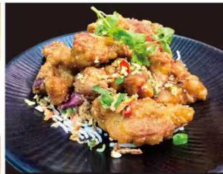
椒鹽排骨 $ 30.8 Stir-Fried Salt and Pepper Pork Spare Ribs