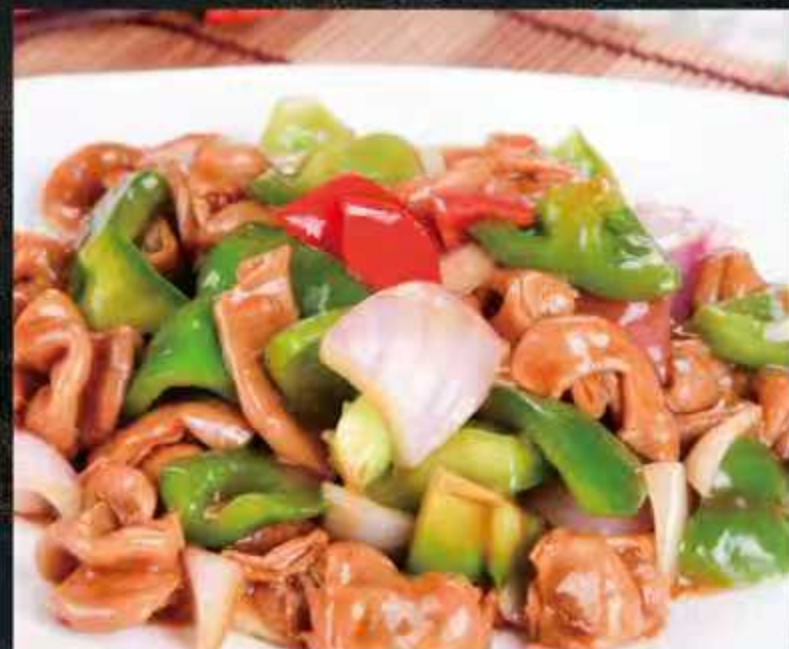
尖椒大腸 $ 38.8 Stir-Fried Pork Intestines with Hot Peppers