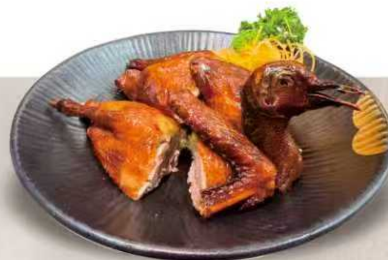
紅燒乳鴿 Deep Fried Braised $ 48.8