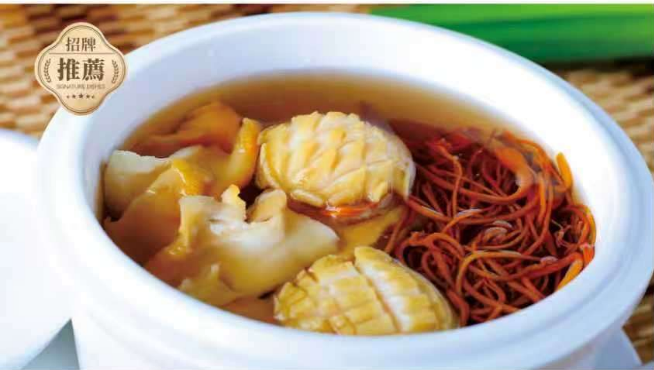
蟲草鮑魚燉盅 $16.8 Cordyceps, Abalone & Lean Meat Soup