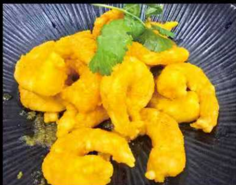
金衣蝦球 $38.8 Stir-fried Prawns with Egg Yolk