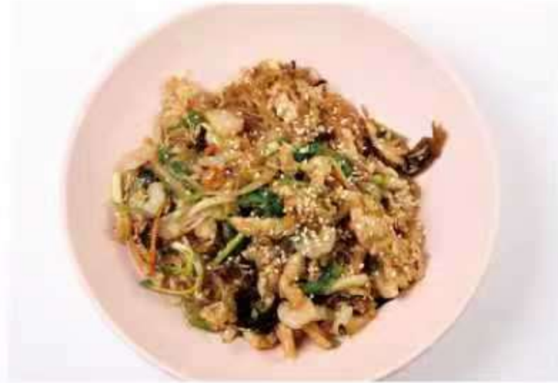
新加坡炒米 $23.8 Singapore Fried Vermicelli