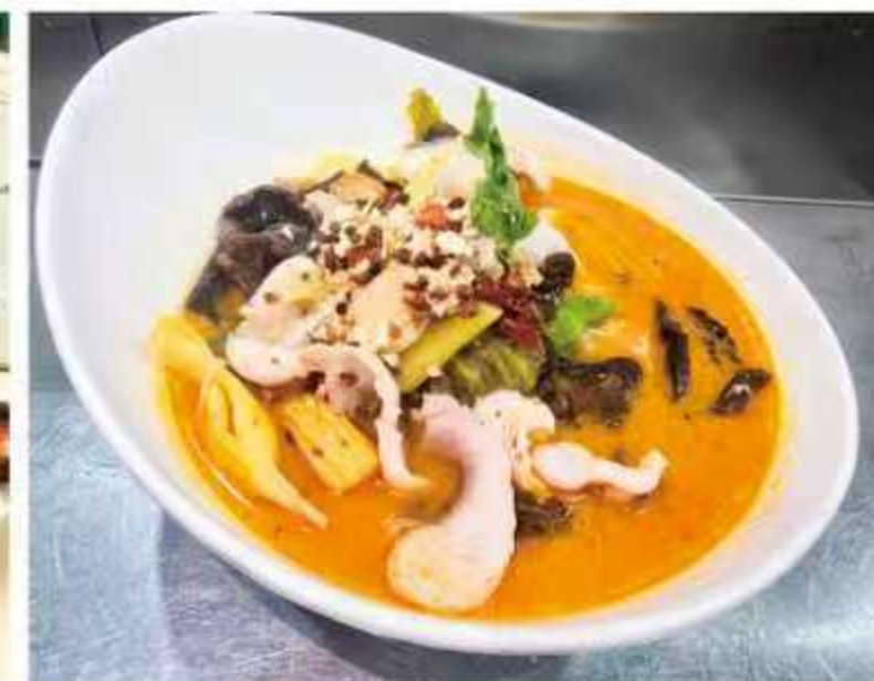
川湯酸香魚 Poached Fish with Pickled vegetables