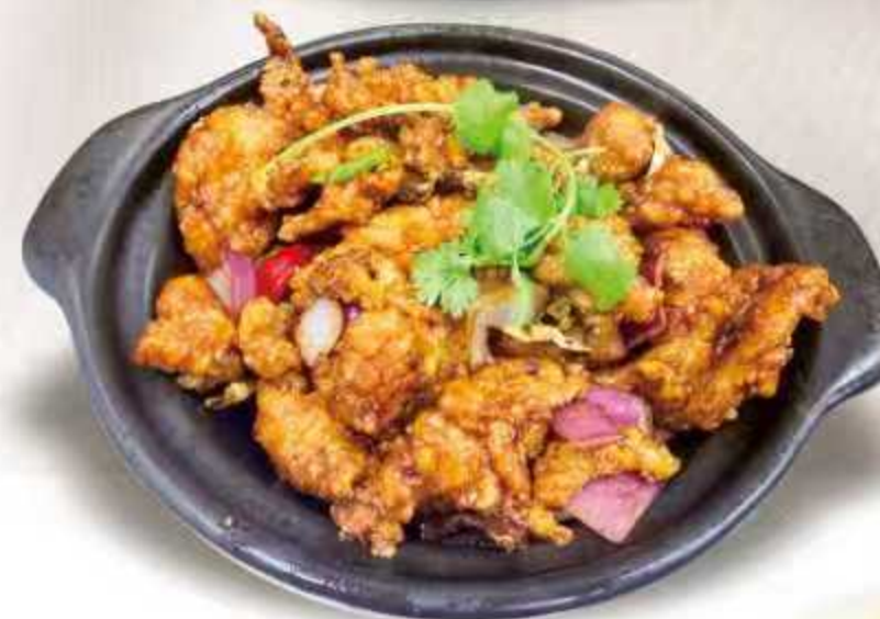
三杯雞 Three-Cup Chicken with Fragrant Sauce $ 33.8