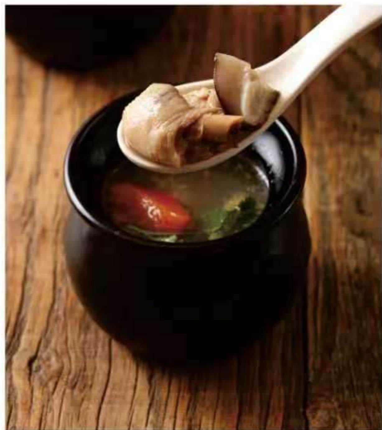
滋補雞盅 $13.8 Nourishing Chicken Soup