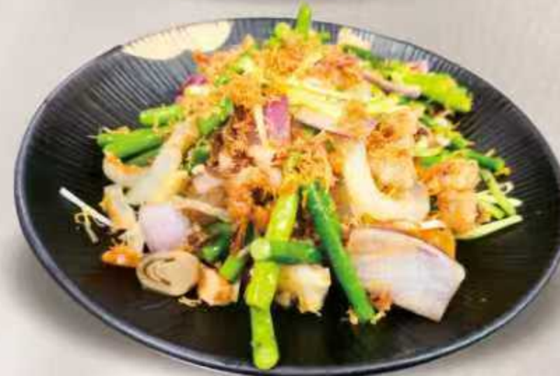
小炒皇 Stir-fried King mixed stir-fried of fried squid, shredded taro, dried shrimp, sliced roast pork, garlic chives, garlic sprouts & walnuts $ 43.8