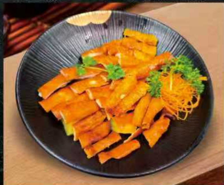
脆皮酥炸大腸 $ 38.8 Crispy Fried Pork Intestines