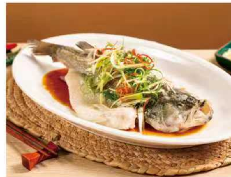
蒸香鱸魚 Steamed Murray cod