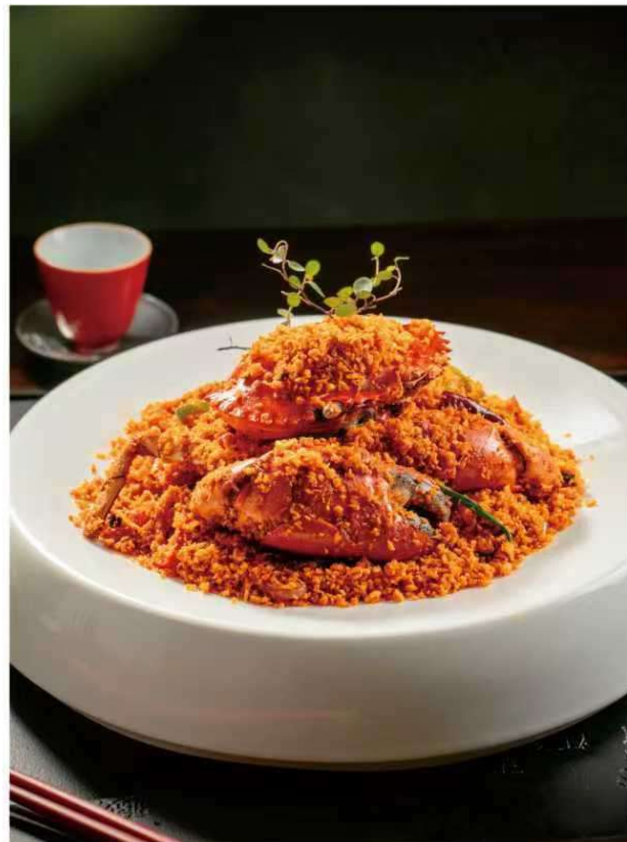
姜蔥肉蟹 時價 market price Live Mud Crab with Ginger & Shallots