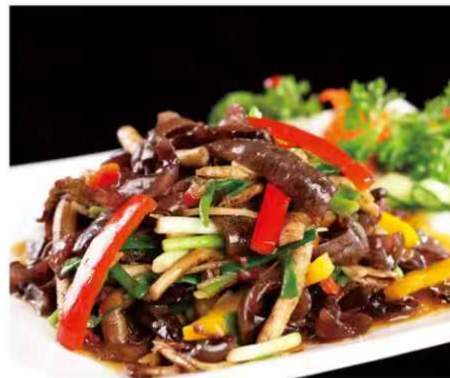
蔥爆海參 $48.8 Stir-fried Sea Cucumber with Scallions