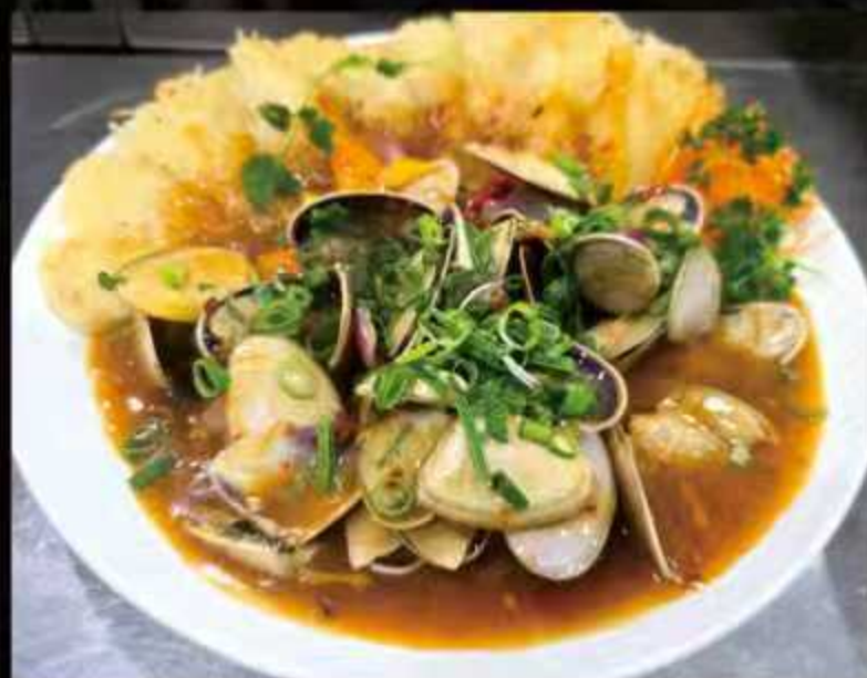
XO/豉汁炒活蜆或蒜蓉蒸 Wok Fried fresh Pipis with Chef's Supreme XO / Black Beans Sauce or Signature Garlic sauce steamed Pipis