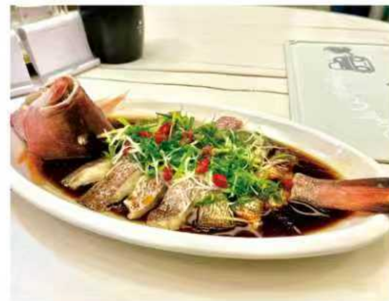
蒸香紅三刀 Steamed Red Morwong