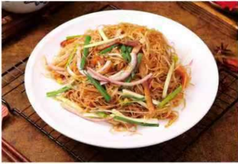
豉油皇炒面 $18.8 Soy Sauce Fried Noodles