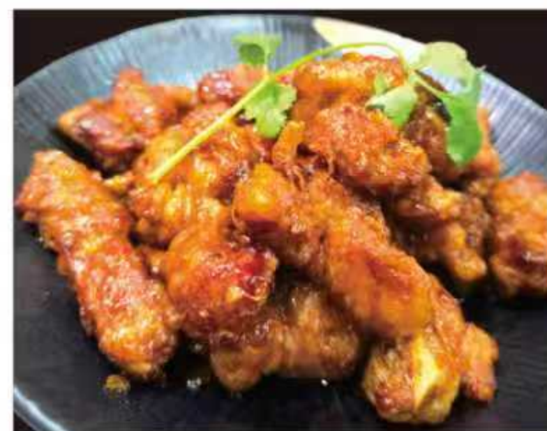
馳名鎮江肉排 $ 33.8 Famous Zhenjiang Pork Ribs

我們的豬肉，讓您吃得放心，吃得健康！ 肥瘦相間，入口即化， 豬肉的鮮嫩，是舌尖上的幸福暴擊！