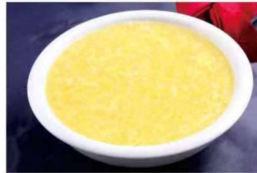
玉米雞粒羹 Chicken & Sweet Corn Soup $7