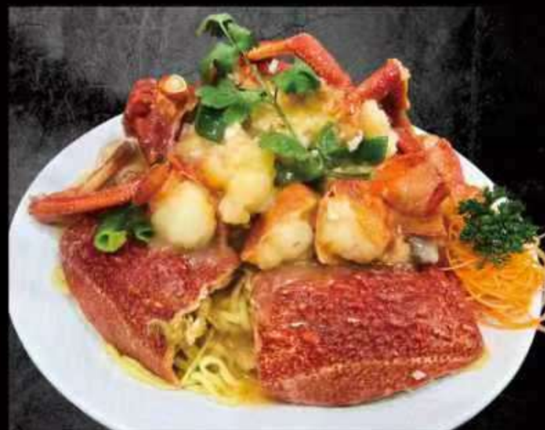
姜蔥龍蝦 時價 market price Stir-fried Lobster with Ginger & Shallot