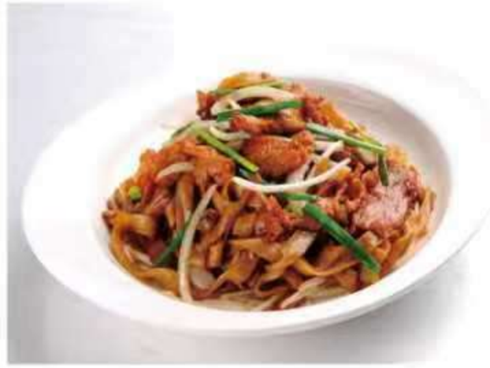
幹炒牛河(牛/雞/肉絲) $23.8 Stir-Fried Flat Rice Noodles (Beef / Chicken / Shredded Pork)