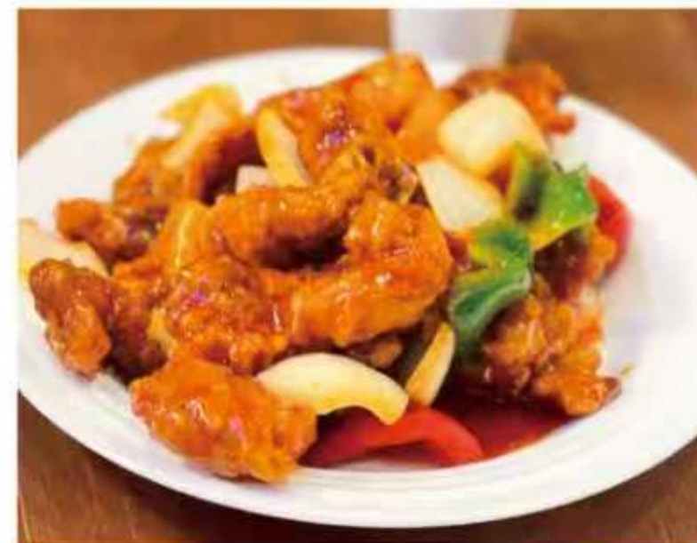
粵式生炒骨 $ 30.8 Stir-Fried Pork Ribs