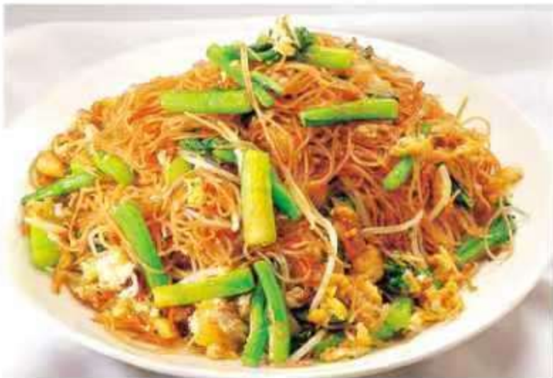
XO四季豆炒米粉 $18.8 XO French Beans Fried Rice Noodles