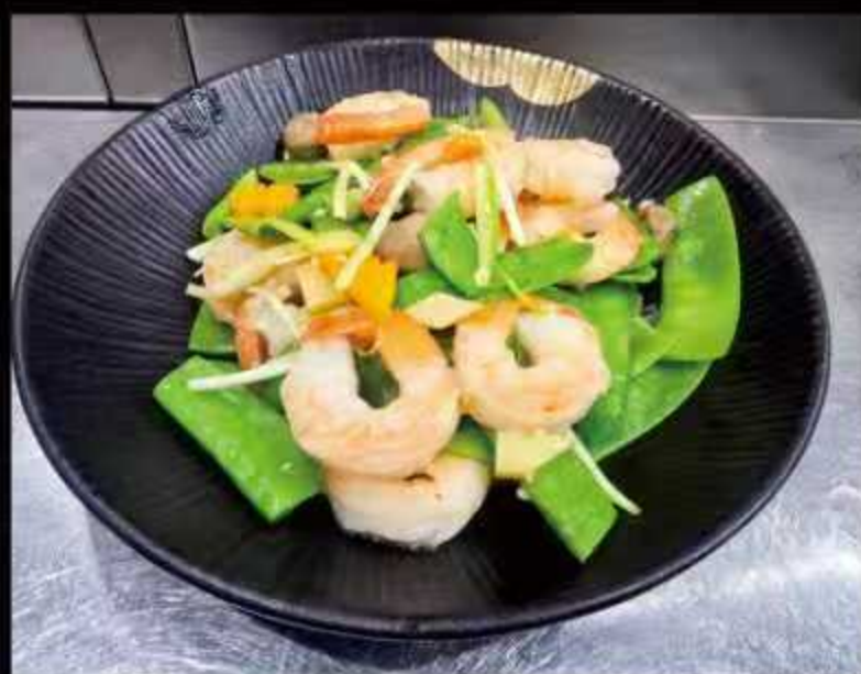
翠綠蝦仁 $39.8 Stir-Fried Prawns and Asparagus