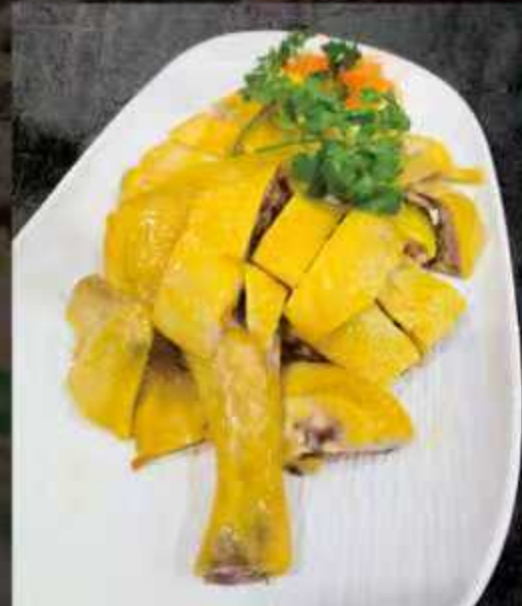
鄉香白切雞 Poached Free-range Chicken $ 33.8