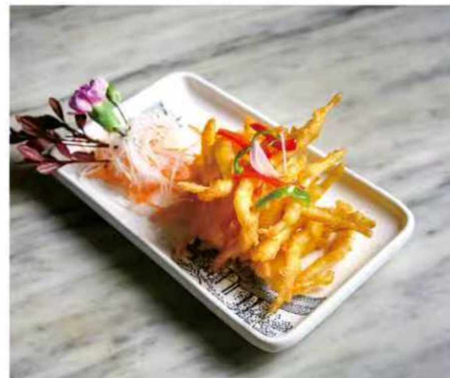
椒鹽白飯魚 $32.8 Salt & Pepper Silver Fish