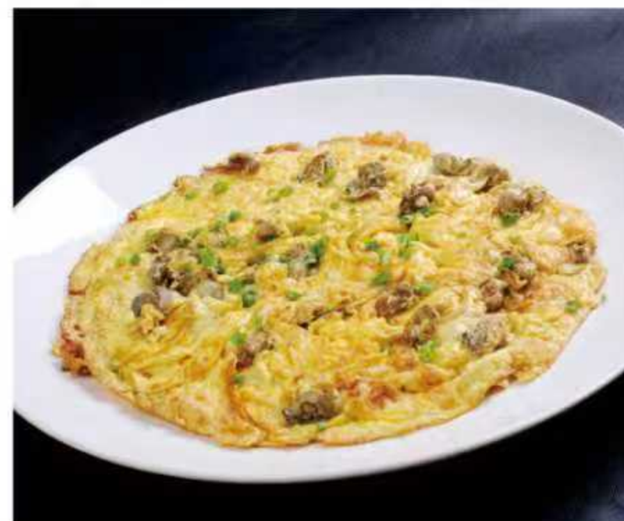
蠔仔煎蛋 $33.8 Oyster Omelette