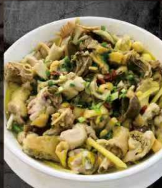
荷葉冬菇蒸走地雞 Steamed Free-Range Chicken with Mushrooms in Lotus Leaf $ 38.8