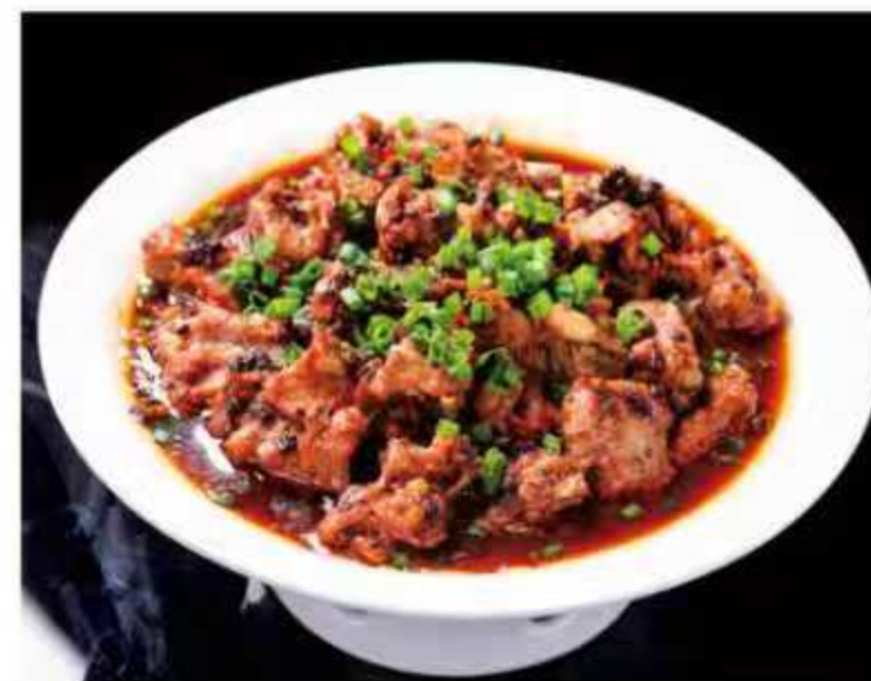
豉汁蒸排骨 $ 30.8 Steamed Pork Ribs with Black Bean Sauce