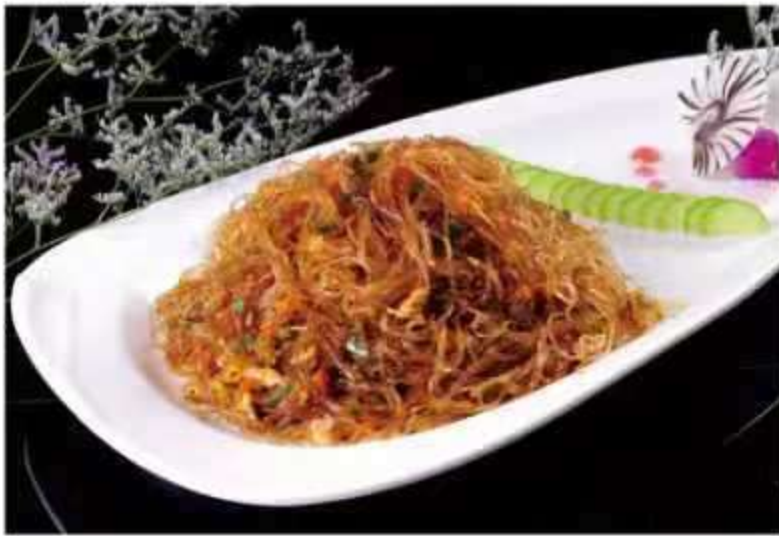
海鮮炒面/粉 $28.8 XO French Beans Fried Rice Noodles