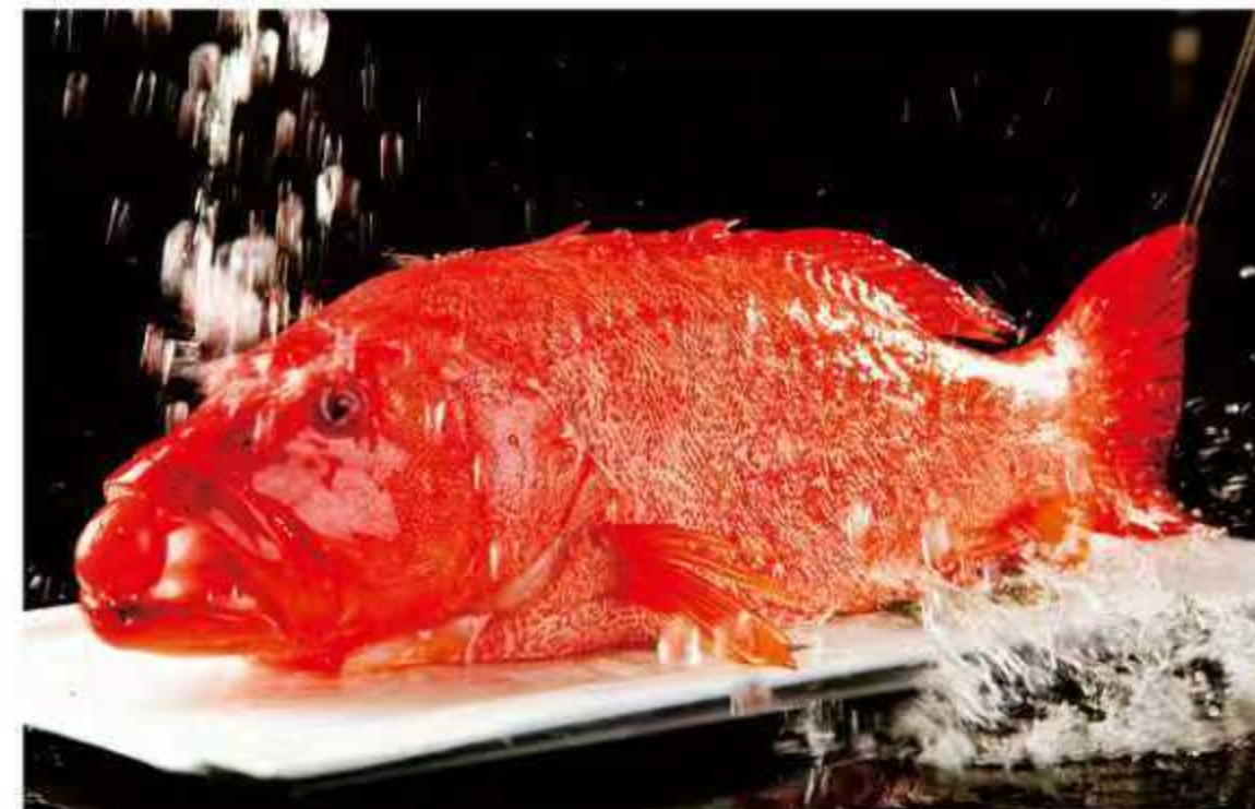
星斑 Steamed live Coral Trout with Ginger & Shallot