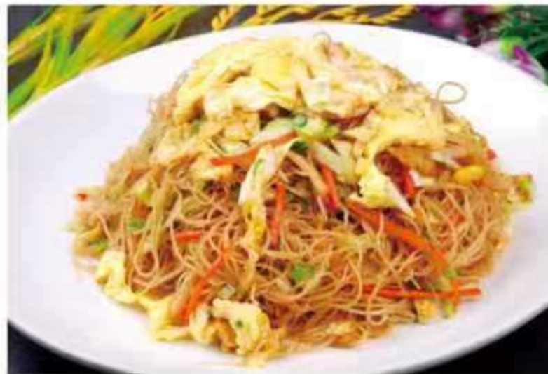
蔥花蛋炒米粉 $18.8 Spring Onion & Egg Fried Rice Noodles