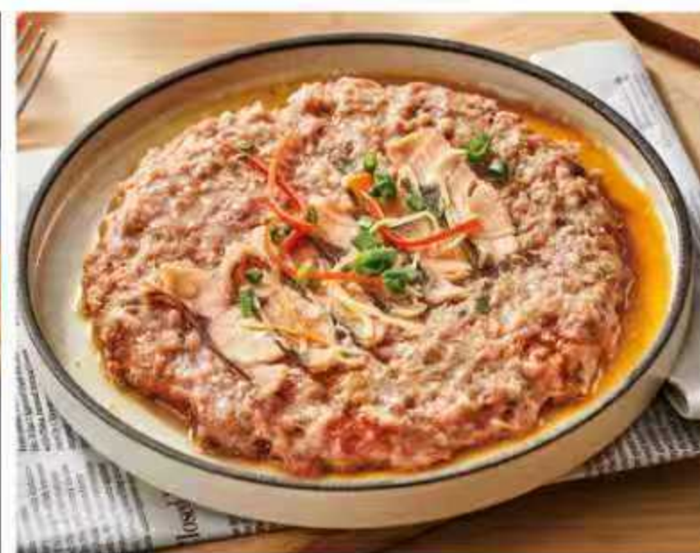
鹹魚蒸肉餅 $ 30.8 Steamed Pork Patty with Salted Fish