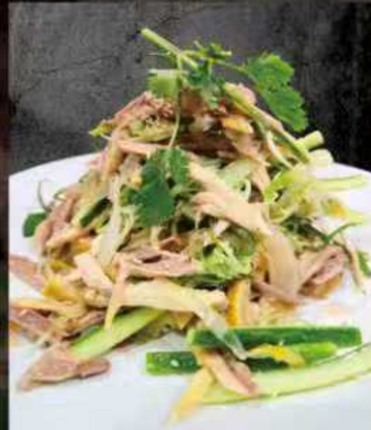
招牌海蜇手撕雞 signature Jellyfish & shredded Chicken $ 38.8