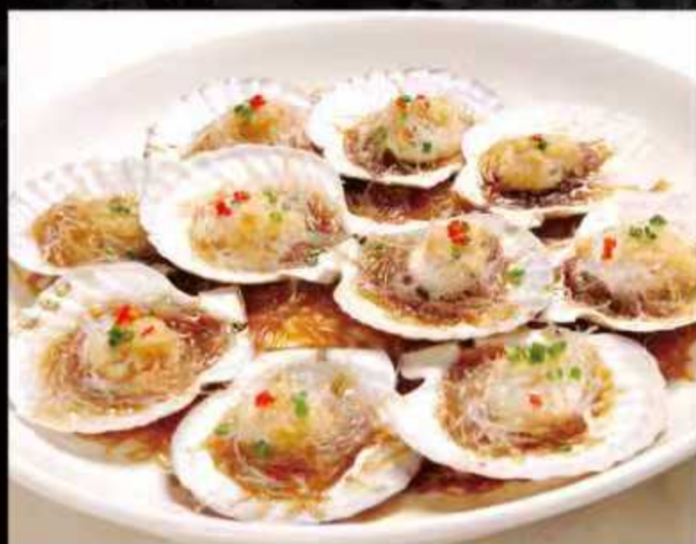
姜蔥蒸帶子 $00.0 Steamed Scallops with Ginger and Scallions