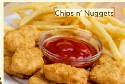
Chips n' Nuggets