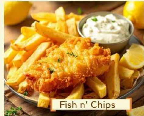
Fish n' Chips