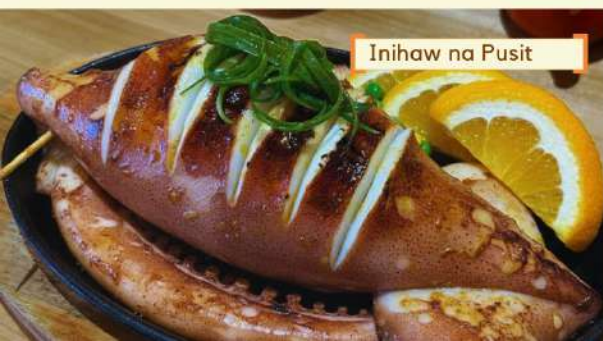
Inihaw na Pusit