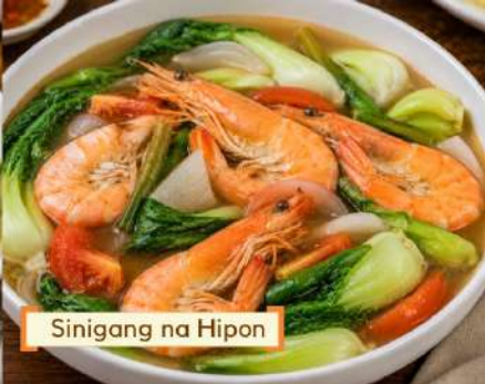
Sinigang na Hipon