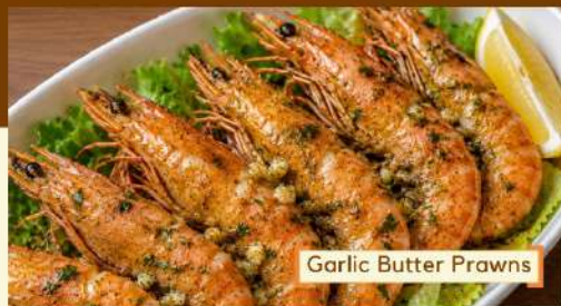
Garlic Butter Prawns