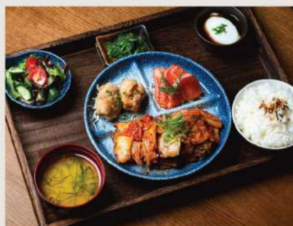
Pork Kimchi & Sashimi Bento $24.8