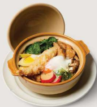
Nabeyaki Udon/Soba $19.8 1 Pc tempura prawn, fresh vegetables, hot spring egg, fish cake, spring onion served in clear soup