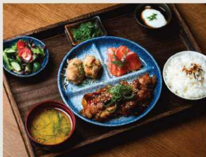
Teriyaki Chicken & Sashimi Bento $24.8