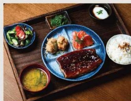
Unagi & Sashimi Bento $26.8