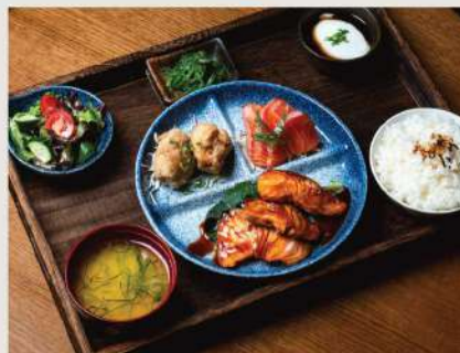
Teriyaki Salmon & Sashimi Bento $26.8