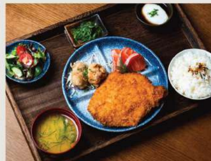
Tonkatsu & Sashimi Bento $26.8