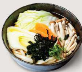
Vege Udon/Soba 🌱 $17.8 Mixed seasonal vegetables in clear soup