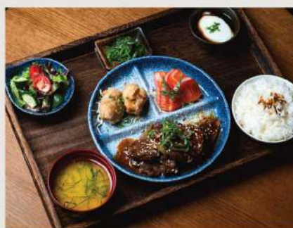
Wagyu Yakiniku Beef & Sashimi Bento $26.8