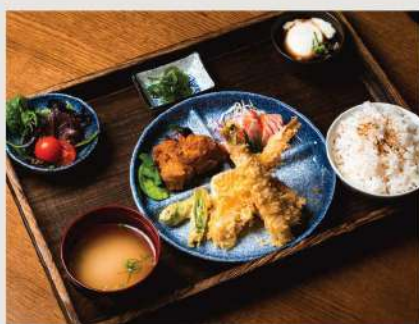
Tempura & Sashimi Bento $26.8

All bento serve with miso soup, salad, egg, karaage chicken, sashimi, steam rice.