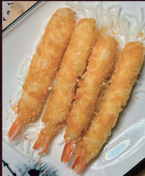
吉列虾 King prawn cutlets (4 Pieces)