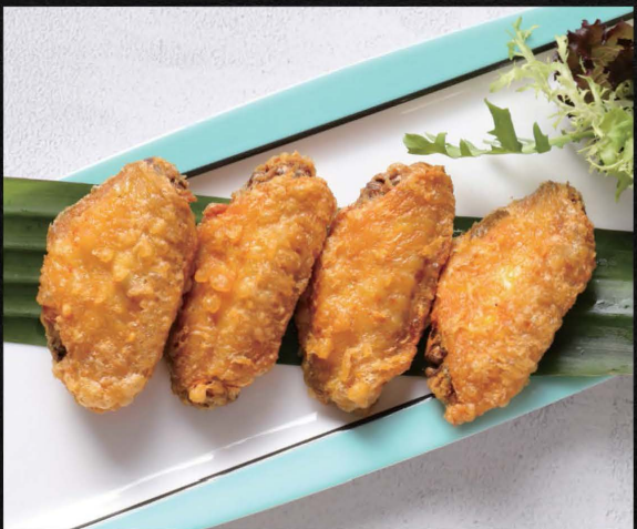
椒盐鸡翅 Salt pepper chilli chicken wings (6 Pieces)