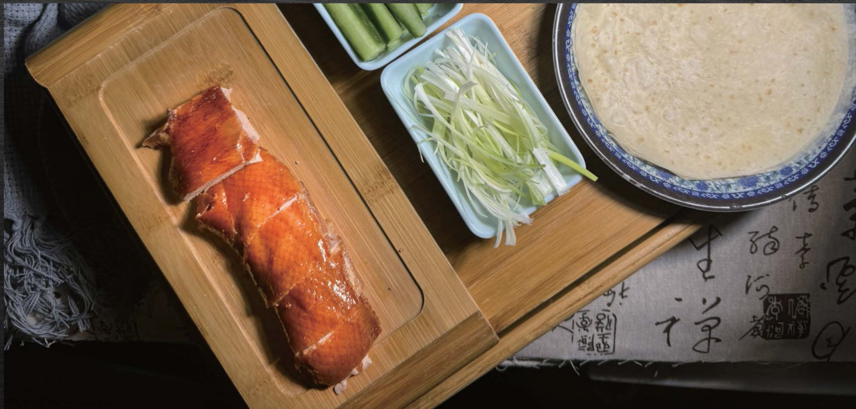
北京片皮鸭 Peking Duck(5 Pieces)extra piece $6