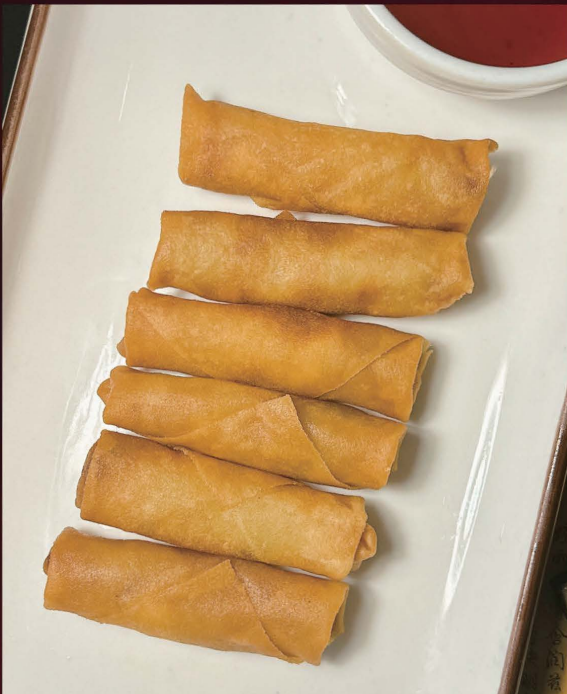
斋春卷 Vegetarian spring roll (6 Pieces)