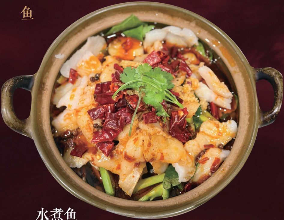
水煮鱼 Poached in Szechuan style