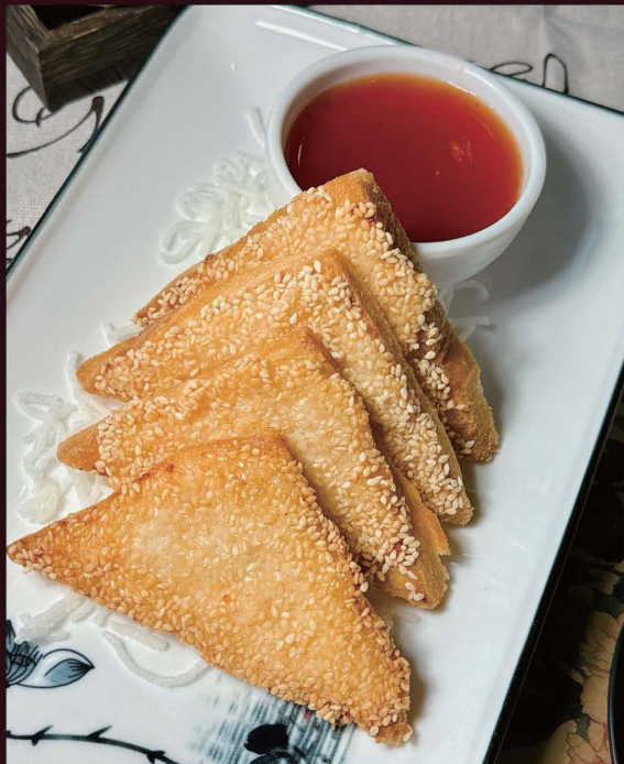
炸虾多士 Prawn Toast (4 Pieces)