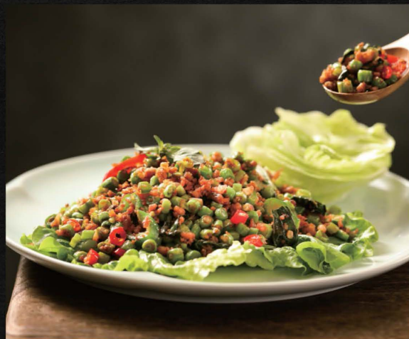
生菜包 sang choy bao (duck or chicken or vegetarian ) min 4X lettuce