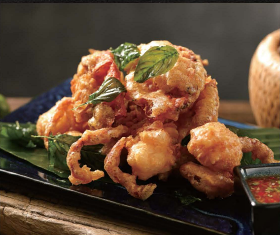
椒盐软壳蟹 Salt pepper chilli soft-shell crab