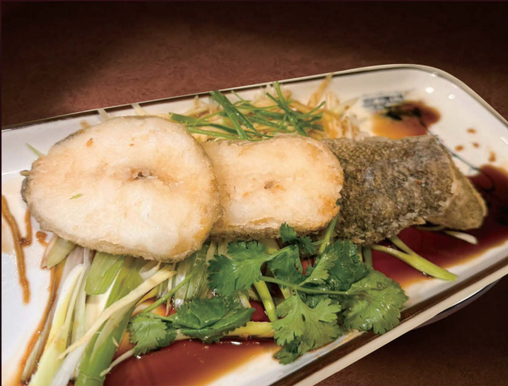
香煎鳕鱼 Pan fried toothfish

图片仅供参考，产品以实物为准 Recipe pictures are for reference only produced to prearrange in kind