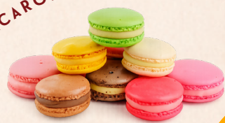
3 pieces (197 cal)