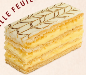
Delicate filo leaves with creme patissiere. Also available in hazelnut or pistachio flavour (597 cal)