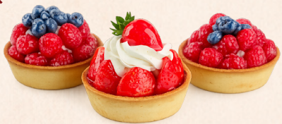
Strawberries or berries (464 cal)