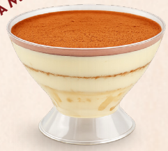
Genoise sponge soaked in freshly brewed coffee with mascarpone cheese & dusted with cocoa (495 cal) non-alcoholic option available*