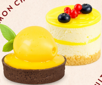
Traditional recipe cheesecake with lemon. Choose between to shapes (689 cal)