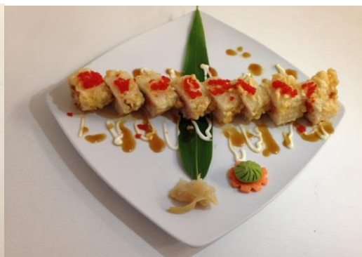
Tempura California Roll

IF YOU HAVE A FOOD ALLERGY PLEASE ASK ONE OF OUR STAFF BEFORE MAKING YOUR ORDER – THANK YOU