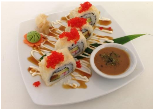
Tempura Taro Special Roll