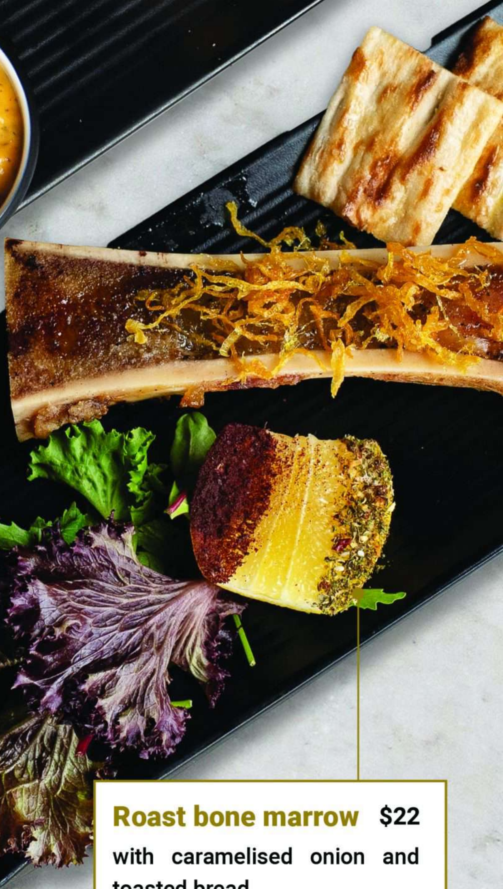
Roast bone marrow $22 with caramelised onion and toasted bread