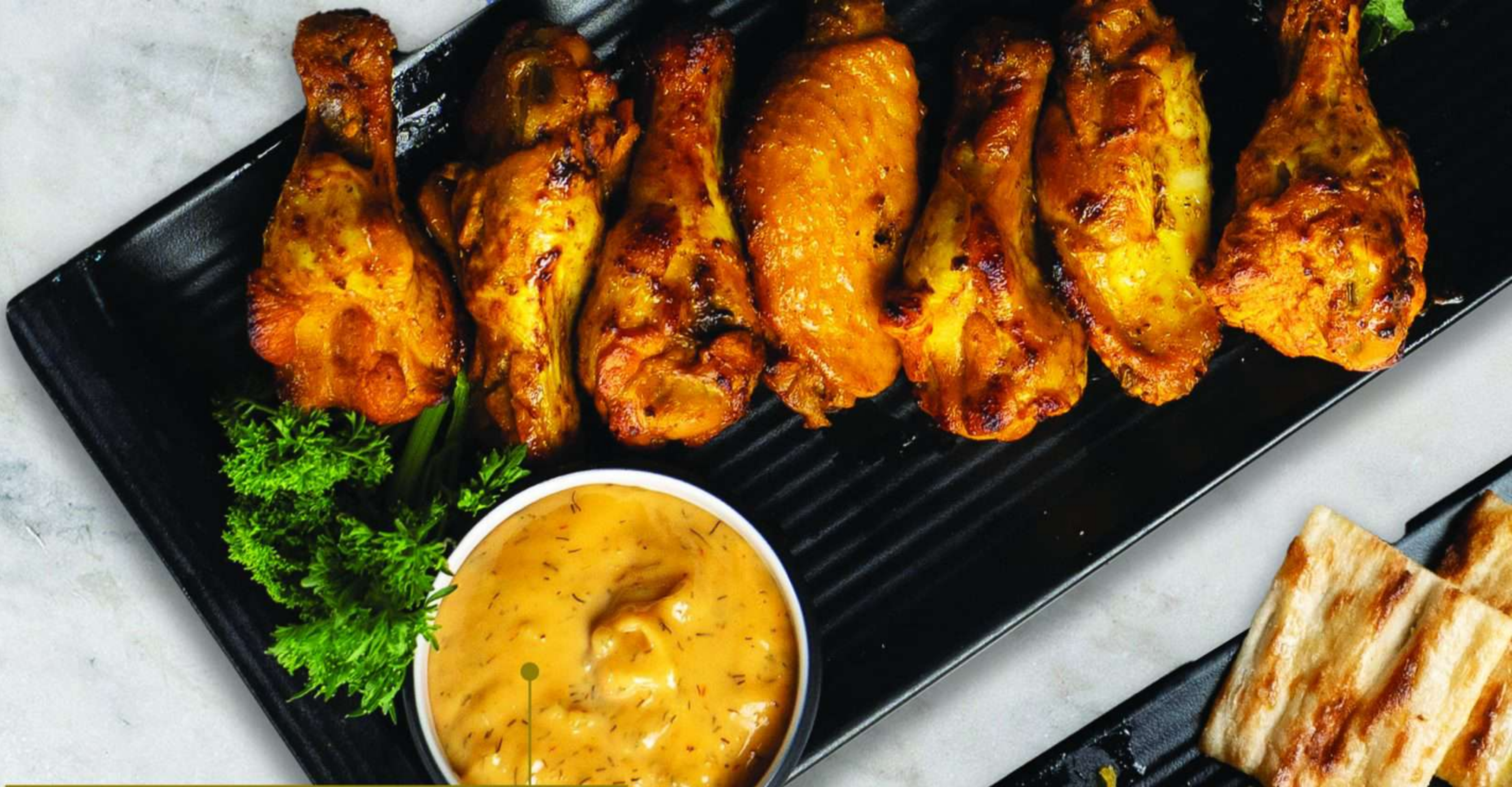
Saffron Chicken Wings $18.50 (Bal Kabab) Grilled chicken wings marinated in saffron, lemon & onion