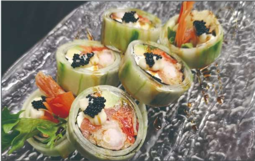
Green Bamboo Roll