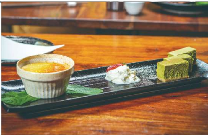
Crème Brûlée Matcha Cheese Cake