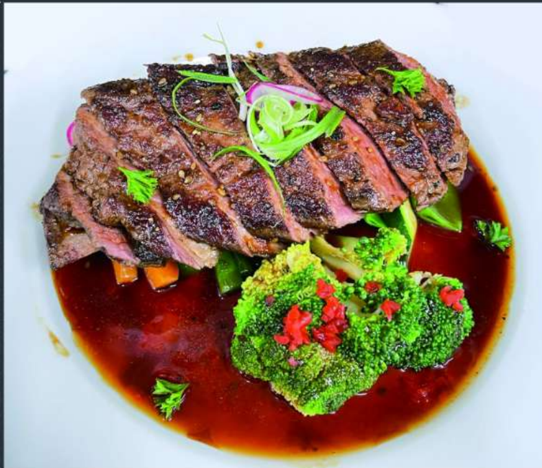
Teriyaki Eye Fillet