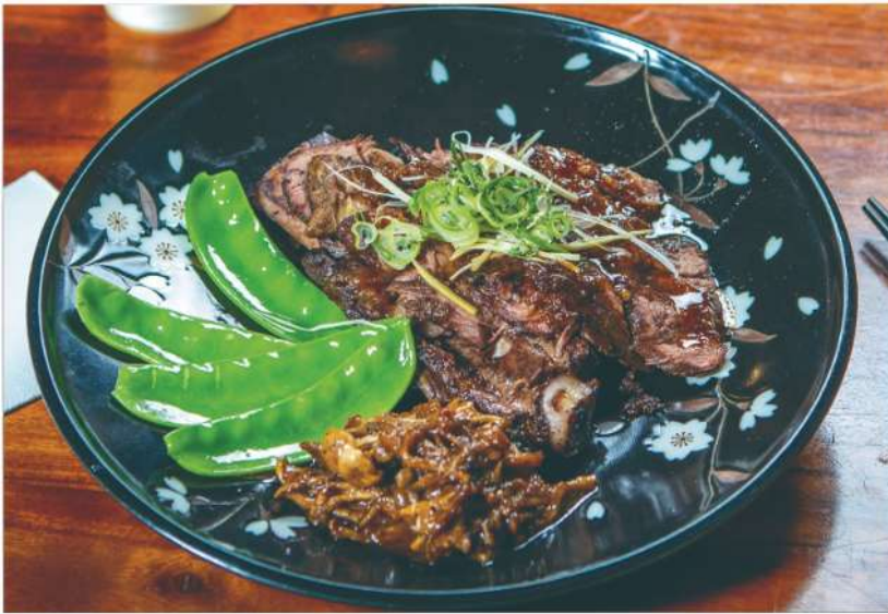
48 hours Beef Short Ribs