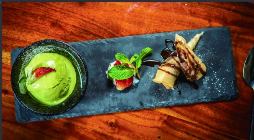
Matcha Ice Cream