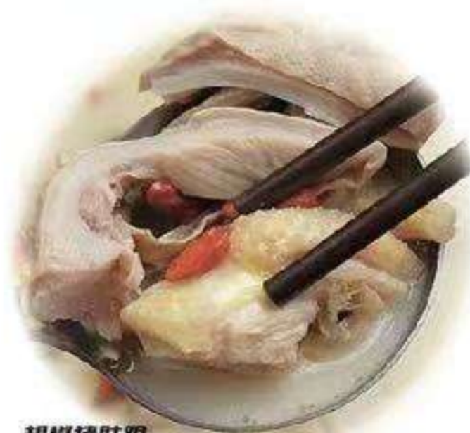
胡椒猪肚鸡 Pepper Pork Tripe Chicken Soup