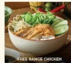
FREE RANGE CHICKEN

★ Fried / Steam Wonton with Egg Noodles $18.90