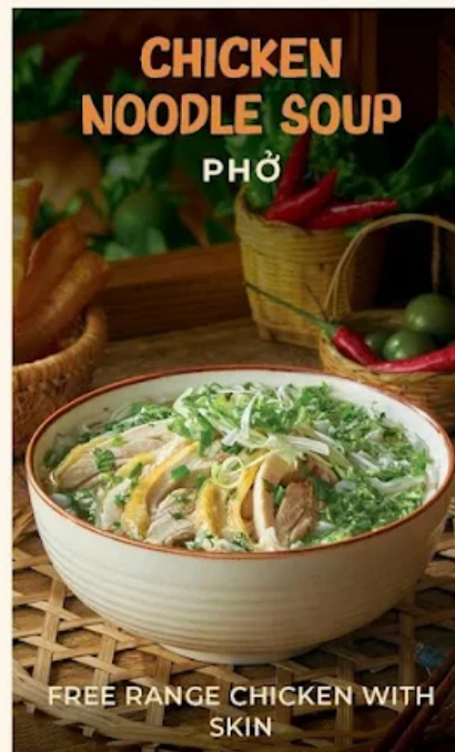
FREE RANGE CHICKEN WITH SKIN