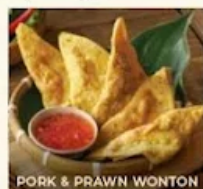
PORK & PRAWN WONTON

Fried Sugarcane Prawn SPCS $8.90 - SPCS $16.90