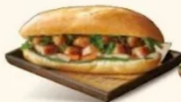
CRISPY PORK ROLL

Toasted, crispy roll with pâté, pickled veg, cucumber, coriander & house sauce.