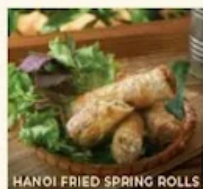
HANOI FRIED SPRING ROLLS

All served with sweet chili sauce or special dipping fish sauce