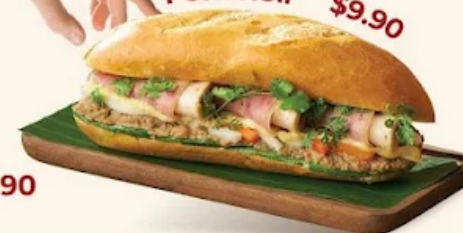
Bánh Mì Thịt Nguội