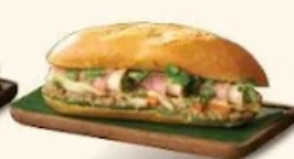
TRADITIONAL PORK ROLL