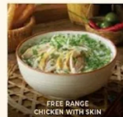
FREE RANGE CHICKEN WITH SKIN

Fragrant Hanoi-style chicken noodle soup made with a clear, slow-simmered broth using free-range chicken, ginger, and shallots.