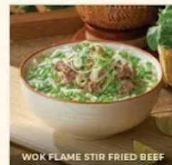
WOK FLAME STIR FRIED BEEF

★ Rare Sliced Beef With Brisket / Beef Balls $19.90