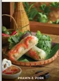
PRAWN & PORK

All served with hoisin-peanut sauce or fish sauce