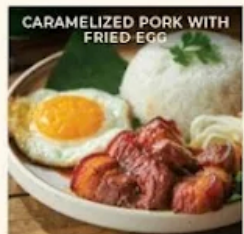
CARAMELIZED PORK WITH FRIED EGG