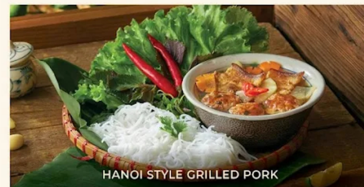
HANOI STYLE GRILLED PORK